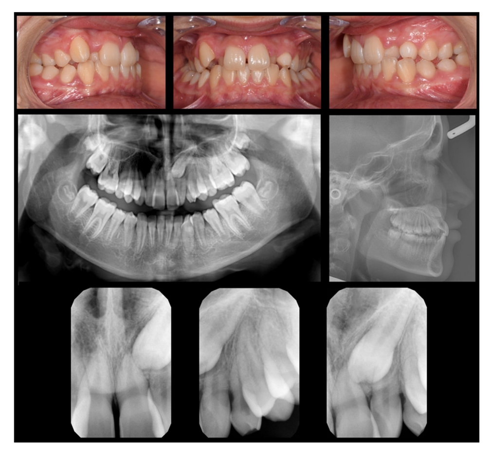
Fig. 1. A case example of 2-dimensional information available for the preliminary therapy planning and the first session. Clinical photos, a panoramic image, a cephalometric image, and 4 intraoral images were available in this case. The preliminary therapy plan was nonextraction and surgical exposure and extrusion of tooth 23. The specialists determined this case to have an indication for a cone beam computed tomography evaluation because of suspected root resorption that would be critical to a successful orthodontic treatment.

making outcome regarding CBCT indications. Based on the results, we recommend that preliminary therapy planning involving extraction of permanent teeth be addressed in the referral along with the reasons for CBCT request, such as localization of the impacted canine/investigation of possible root resorption. Because the prescription of CBCT should preferably be based on the future treatment plan, the referrals should be ordered by the clinician who plans and will carry out the treatment.