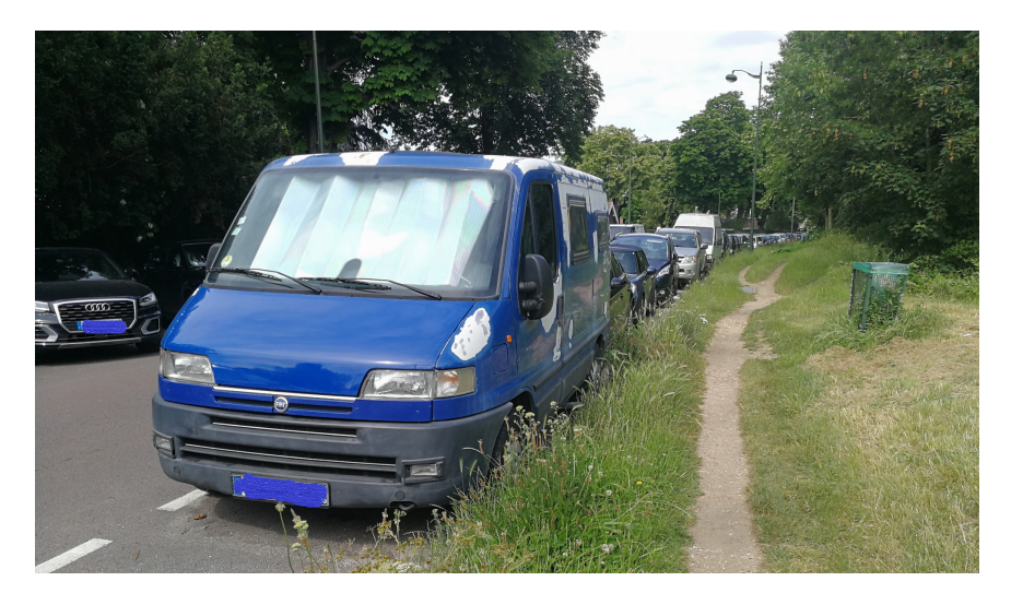
FIGURE 3: A van parked for sex work alongside the road, close to the Paris Racing Club (plate number anonymized).

Having undertaken this tour of the park, one realizes that this huge public space is safely removed from the crowds shown on French mainstream media, such as the those at the Place de la République protesting conservative government reforms, or the yellow vests in Champs-Élysées fighting against taxes and the high cost of living. People come here to enjoy their walks in between these