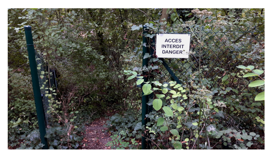
FIGURE 2: One of the many mysterious enclosures blocking entrance to a part of the forest.

private foundation La Bagatelle, where you can pay for entry into its English-style garden with a little château, a restaurant, and an orangery. Walking further west, you pass by a huge rugby field to your right, and you must move in between the polo club, the Golf du Polo du Paris, and the new secluded area of the World Wildlife Foundation. Farther down, the Hippodrome de Longchamps attracts the world's best racehorses and their famous wealthy owners to the weekly races. When you have that horse race arena and the western banlieues of Paris across the Seine on your right, you will have a system of lakes and rivers to the left. Here, you also see the spectacular three-star Michelin art nouveau restaurant Le Pré Catelan, the open-air theater association in the Jardin Shakespeare, or the château, now a restaurant, that Louis-Napoléon Bonaparte (Napoleon III) built for his mistress on one of the islands in the Lac Inférieur.