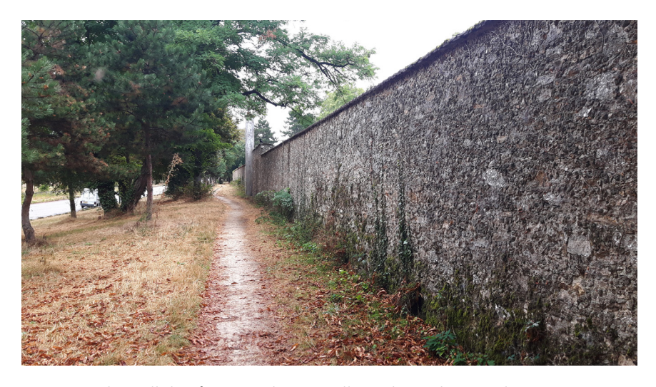
FIGURE 1: The wall that fences in the Bagatelle gardens.

After passing by that architectural wonder, following the paths to the right you are again blocked by the fences of L'Étrier de Paris, another riding club, currently with around a thousand members. Next is the Tir aux Pigeons—originally a trap shooting club, it is now an exclusive leisure club with tennis courts. The path also leads on to the biggest sports club, the Paris Racing Club, a massive structure where its six thousand members can swim or play football, basketball, or tennis. The club features something like 40 tennis courts, Olympic standard swimming pools, plus bars and restaurants. If you now take a westerly direction, you will walk for a long while outside the concrete walls of the