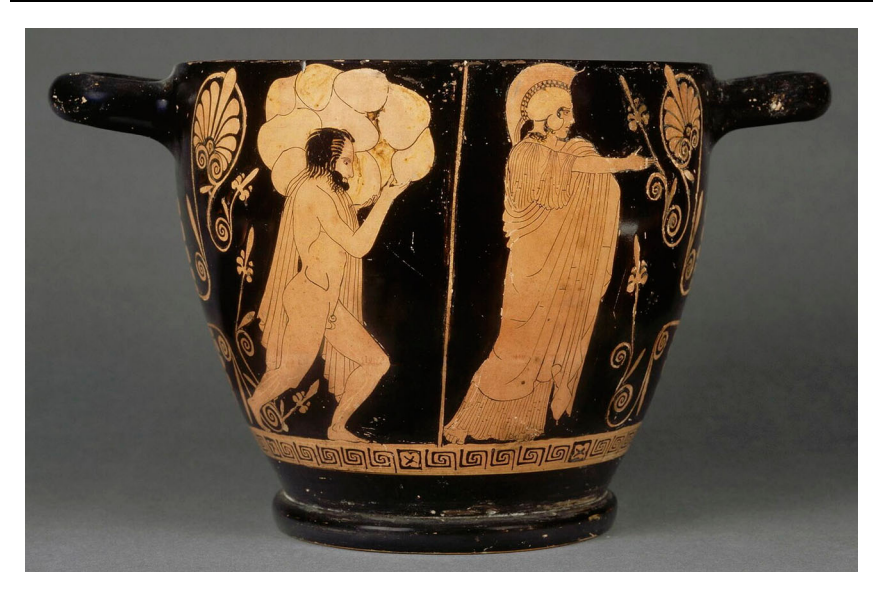
Figure 15. Athena and a giant (ca 440–30 B.C.).

may be observed between these gods. Whereas Athena uses the gesture of command for the purpose of constructive work, having offered life and sustenance to the Athenians through the gift of the olive, Apollon of Olympia orders death and destruction to beastly adversaries against the background of pugnacious chaos, that is the centauromachy that was the subject of the West pediment of the temple of Zeus.<sup>49</sup> Even more striking is the contrast of Aphrodite to the same Apollo, and as a central part of a project that might suggest conscious emulation of and allusion to the temple of Zeus. The Olympian Apollo dispenses death in battle, but as we have seen, the power of Aphrodite assisted by Artemis commands the peaceful creation of life. Serving this function, Aphrodite, like Athena, constructively shapes the future of Athens and the world.