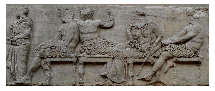
Figure 17. Man, Hermes, Dionysus, Demeter, Ares. https://creativecommons.org/ licenses/by-nc-sa/2.0/legalcode. Photograph by Egisto Sani (detail).

Hermes, with boots on his feet and a traveller's cap on his lap, looks south-eastwards in a calm and composed manner. Dionysus leans on his shoulder in a festive mood, turning away from his table companion, Demeter, to address him. Alone of all gods, in proper order Dionysus sits facing his companion, in the opposite direction from all the other seated deities on the left side, and indeed perversely from all the gods, if the reconstructed half-circle arrangement first proposed by Petersen (1873, 239-245, 301-302) should be accepted as reflecting some kind of divine reality.<sup>57</sup> Instead of solemnly watching whatever it is that the others are watching, Dionysus looks as if he has been trying to get intimate with Demeter. For whatever reason, he has decided at this moment to turn around, not to look at humans or the world, but to address Hermes. His left arm is raised, sometimes supposed to have held the thyrsus, but he is not in office, and the point of the gesture is lively conversation.<sup>58</sup> The hand may have held a cup, though (Petersen 1873, 260). Apollo on the opposite side (Figure 1), turning to address Poseidon, lifts his hand in the exact same manner as Dionysus, and while it, in turn, may have held a laurel or (better) lyre, in both cases, the gesture is related to social interaction. The significance of the raised hands is not astonishment, as Petersen diffidently suggested (1873,