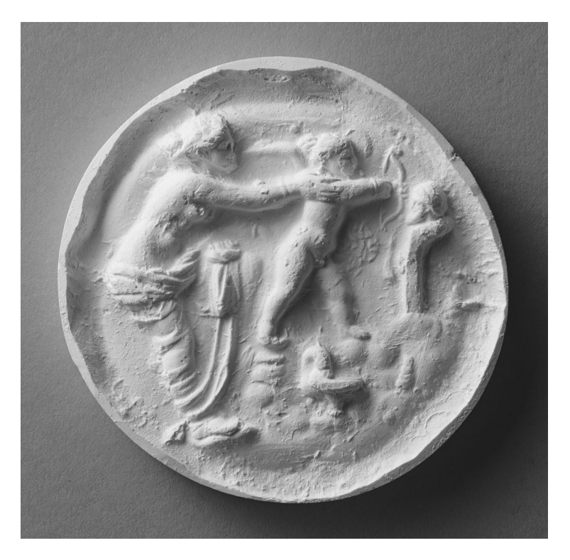
Figure 11. Aphrodite and Eros. Cast after mould in the collection of the University of Zurich, inv. 3328.