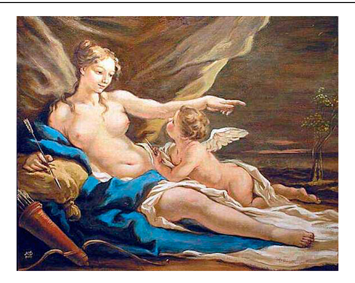
Figure 8. Giovanni Pellegrini (early 1700s).<sup>31</sup>

as a non-player, to make it clear to the viewer that he is not the object of her indication (cf. Fehl 1961, 14, 1974, 317). This adds to the picture of the humans in the frieze interacting with the gods in no other way than through the ritual acts that they are performing.