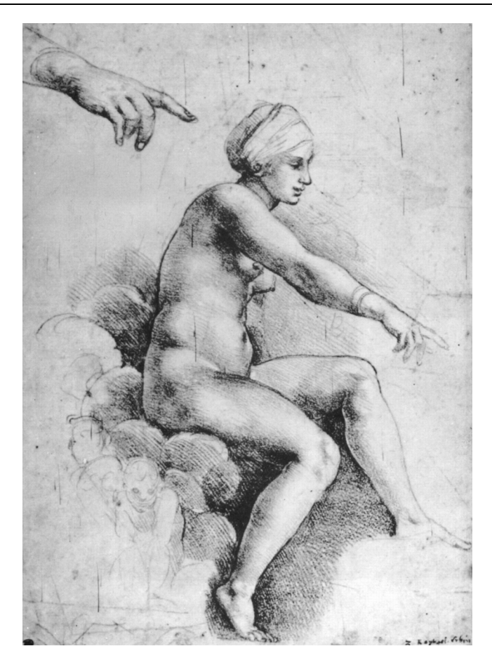
Figure 6. Raphael: Study for the Loggia of Psyche.

The Cyprian to the Muses: "You honor Aphrodite, little misses, Or I'll arm Eros against you. " And the Muses to the Cyprian: "That's mouth for Ares. That kid won't fly for us."