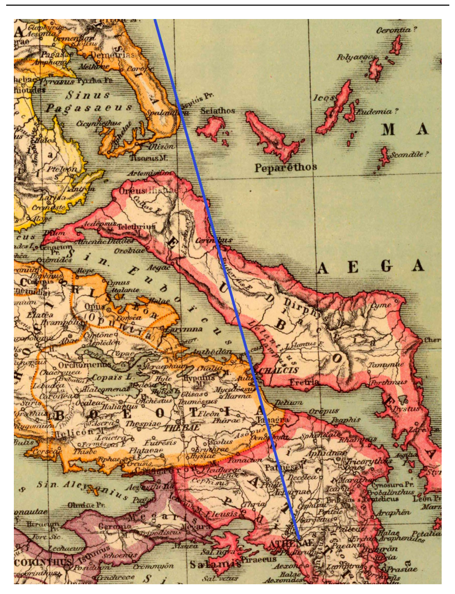
Figure 3. Direction of the gaze of Poseidon.