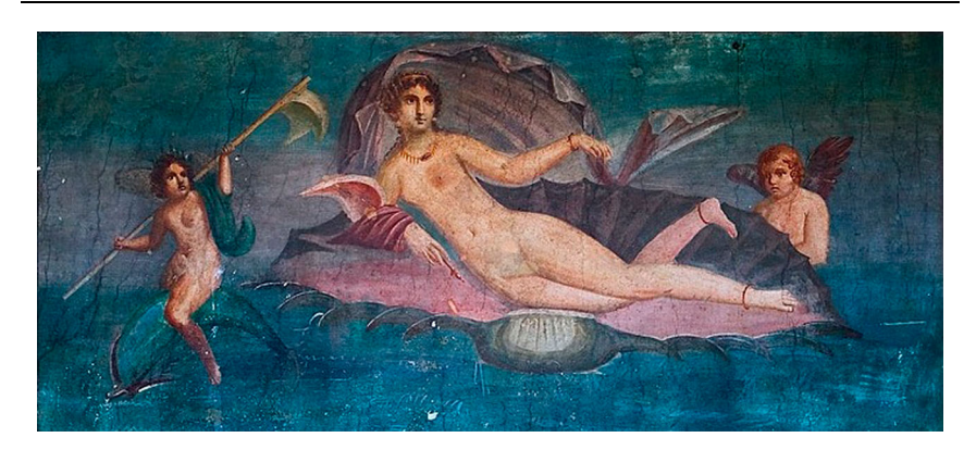
Figure 12. Venus from Casa della Venere in Conchiglia in Pompeii.

and the goddess of sex, respectively. The dark and cynical paradigm from high canon is the Hippolytus of Euripides. But on the frieze, the goddesses act sisterly. Looking at Artemis though, who is preserved, we can see, when her face is properly lighted, a furrow at her nose (Figure 13). Her mouth is slightly open (Brommer 1977, 119).