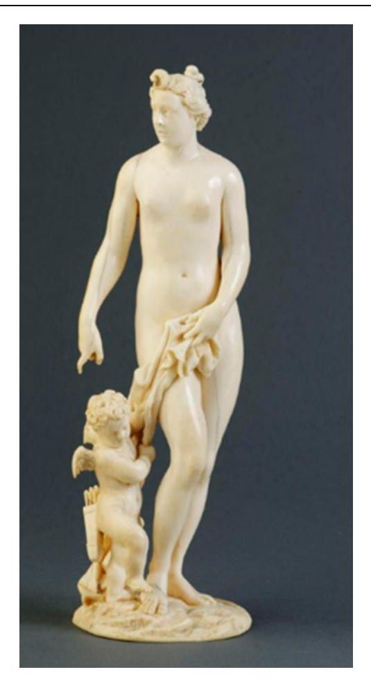
Figure 9. A. Capuz. (mid-1800s?). Courtesy V&A Collection.<sup>35</sup>

Love, cruelly but beneficially directing and controlling mortals. It does not matter whom she is pointing at right now, but the authoritative pointing as such defines her universal function. Even so, the two gods that accompany her take a genuine interest in her indication. Eros performs his proper duty, but what is the concern of Artemis? Her left arm is even holding on to Aphrodite's right one, as a fragment identified as late as 1972 shows.<sup>36</sup> The intimacy is remarkable, as in literature, these goddesses are depicted as each other's antipodes, the goddess of chastity