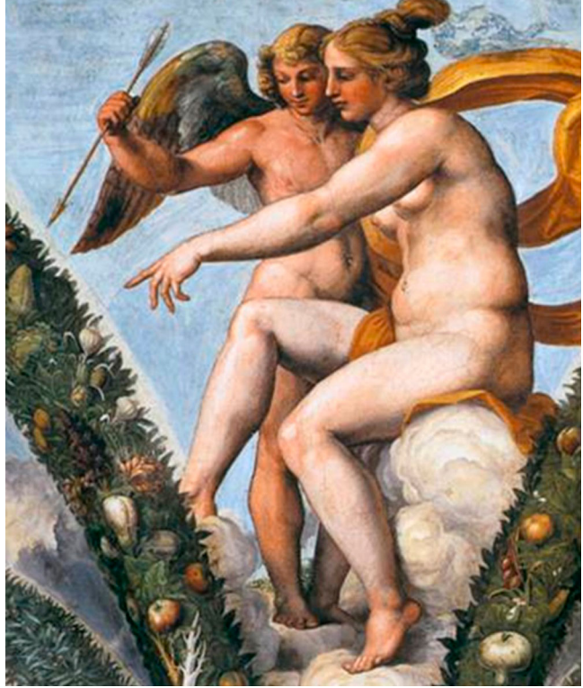
Figure 5. Workshop of Raphael: Venus and Cupid.

These artists knew, as did Pheidias and his assistants, that this interaction of Aphrodite and Eros is a universal motif, indeed a worn cliché of Greek poetry, where Aphrodite goes by the name of the Cyprian: