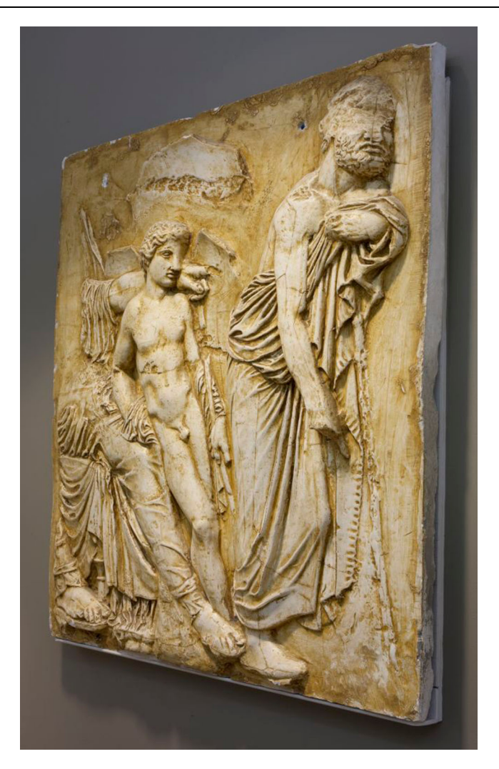
Figure 4. Reconstructed cast of Aphrodite, Eros, and old man.

Later, though, Domenico Beccafumi and Giovanni Pellegrini have painted unambiguously happy and smiling Venuses directing Cupid in this manner (Figures 7 and 8). A probably nineteenth-century Spanish ivory shows a Venus that is keeping her finger active and ready, looking for somebody to point at (Figure 9).