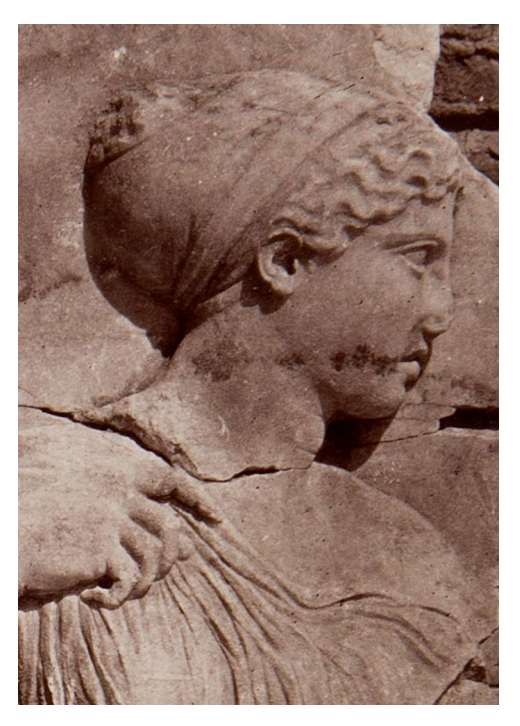
Figure 13. Artemis.<sup>40</sup>

dispassionate mistress (Figure 4).<sup>41</sup> His arm on Aphrodite's leg may signify a closer bond, but it might also merely be instrumental, the act of hiding his weapon under her clothes. Rather than the academic question of the genealogical relations of the gods, though, the point is that Artemis as the goddess of childbirth is depicted as involved, out of reluctant duty, in Aphrodite's coupling business. She holds the arm of Aphrodite because their respective domains of power overlap. Artemis, when favourable, will accept the loss of virginity of a woman as a sacrifice to herself, and she will help those who get pregnant from Aphrodite's game.