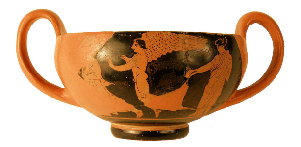
Figure 10. Woman, Eros, and Aphrodite (?) (450–400 B.C.).<sup>37</sup> Restored skyphos: image from Bosch i Gimpera and Serra i Ràfols (1951–1957, 125).