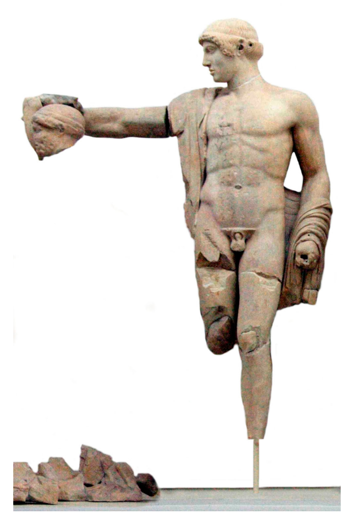
Figure 16. Apollon of Olympia (ca 460 B.C.). https://creativecommons.org/ licenses/by-sa/4.0/legalcode. Photograph by Vicenç Valcárcel Pérez.

generative function build and improve upon society, is an expression of the optimism characterizing the Athenian interbellum period between the Persian and Peloponnesian wars, attested in literature at least in Aeschylus, for instance, a famous fragment from the Danaides where Aphrodite speaks in defence of her activity.<sup>50</sup> The contrast between love and