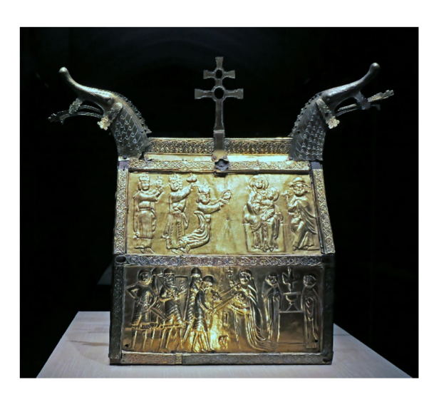
Figure 11: Hedalen Stave Church: Martyrdom of St Becket. c. 1250. Hedalen. Image: Amanda Slater. Licence: CC BY-SA 4.0.

such as the widespread Sigurðr "the Dragonslayer" legend. A number of such chairs exist today, such as the chair from Gålås (Oslo, Kulturhistorisk Museum, C26500) dated c . 1200 (Engelstad, 101) (Figure 12), and the chair from Gårå (Oslo, Nasjonalmuseet, OK-10700) roughly dated to the subsequent century (Schramm, 796). Especially, the example from Gålås shows related, large-sized animal heads with long tongues on the backrest, and this specimen mirrors the examples from AM 226 fol. and Helgastaðabók. Norwegian chairs such as the ones from Gålås and Gårå were generally used for officials or bishops, and it is likely that similar chairs were also known and used in Iceland. Church art, such as the mentioned Madonna from Urnes, may have also served as visual examples, where clearly identifiable ears and long noses of the Nordic-styled animal heads attached to the sedes sapientiae support the Scandinavian style of the seated holy figure.