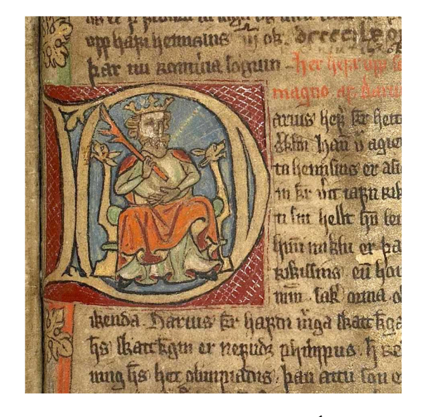
Figure 5: AM 226 fol., f. 129r: Alexanders saga. 1350–1370. Reykjavík, Stofnun Árna Magnússonar í íslenskum fræðum. Image: Jóhanna Ólafsdóttir. Licence: CC BY-SA 4.0.

in AM 226 fol. is found on f. 129r (Figure 5), at the beginning of Alexanders saga , a vernacular redaction of the twelfth-century Alexandreis by Walter of Châtillon on the life and deeds of Alexander the Great (356–323 BC) (Würth, 316–24). According to the rubric and the name, it introduces in the main text, the initial depicts the enthroned Persian King Darius III (380–330 BC), who is one of the main enemies of Alexander the Great in the saga text. The image is a combination of several stock images, among others that were also used for the Elkanah/King Saul initial on f. 79r. Yet, the bulky appearance of the animal heads in that initial is not repeated in the King Darius III initial: The more filigree-like animal heads on the King Darius III initial mirror the ones found in the King David initial on f. 88r. Despite the peaceful appearance of King David in that initial, on f. 88ra4, his actions are referred to as those of a vikingr , meaning that he was pirate-like in battle actions. King Darius III, similarly, is described in the saga as being a fairly cruel ruler with strict taxes to be paid to him by his tributary kings. He is depicted as holding an unusual form of a sceptre (a palm leaf