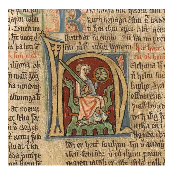
Figure 3: AM 226 fol., f. 79r: Stjórn. 1350–1370. Reykjavík, Stofnun Árna Magnússonar í íslenskum fræðum. Image: Jóhanna Ólafsdóttir. Licence: CC BY-SA 4.0.