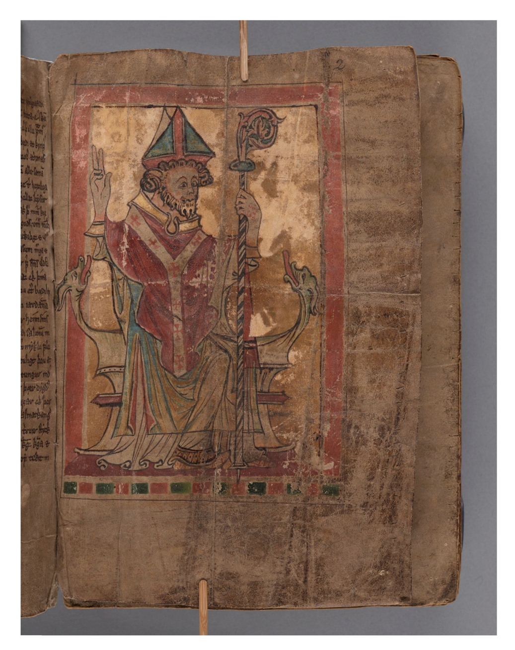
Figure 7: Isl. perg. 4:o 16 (Helgastaðabók), f. 2r: St Nicholas. 1375–1400. Stockholm, Kungliga biblioteket.

may indicate a moral reply to the textual content of Bréf Magnúss konungs. Similar to the example from Flateyjarbók, the symbolic trespassing by Jón may be interpreted as a violation of the royal sphere of power, which is further indicated in the gesture of the king and the animal head with its stretched-out tongue looking towards the receiver of the law. The imagines clipeatae , on the other hand, may depict some of the "very prudent men," who, according to Bréf Magnúss konungs , contributed to the law code (Jónsbók, 77).