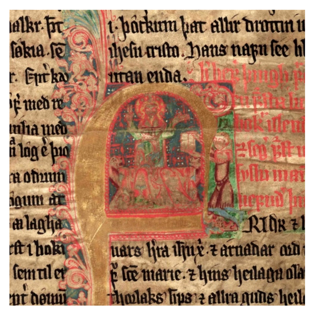
Figure 9: AM 350 fol. (Skarðsbók), f. 2r: Jónsbók. 1363. Reykjavík, Stofnun Árna Magnússonar í íslenskum fræðum. Image: Jóhanna Ólafsdóttir. Licence: CC BY-SA 4.0.