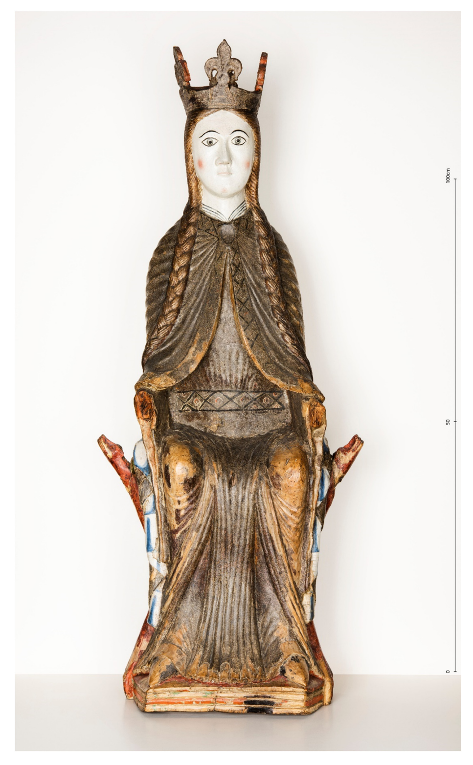
Figure 1: MA 0046 (Madonna from Urnes). 1150–1200. Bergen, Universitetsmuseet – Kulturhistorisk Museum. Image: Adnan Icagic. Licence: CC BY-SA 4.0.

determined with certainty whether the statue was produced in Scandinavia or imported from another art centre in Europe (Kroesen and Kuhn, 41), it shows Mary in a Nordic fashion, with the four animal heads attached to her curule seat and each head looking upwards.