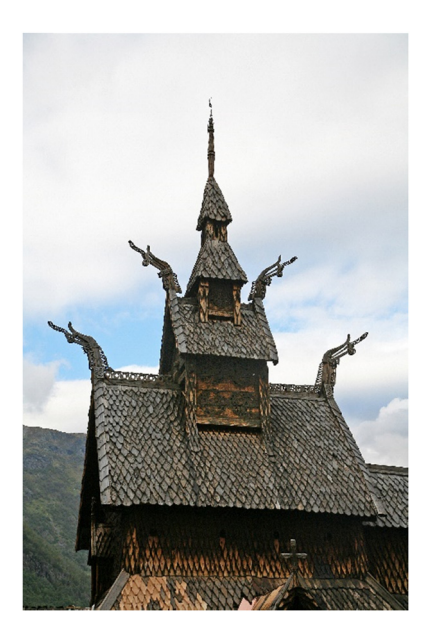
Figure 10: Borgund Stave Church: Dragon head. 1180. Borgund. Image: W. Bulach. Licence: CC BY-SA 4.0.