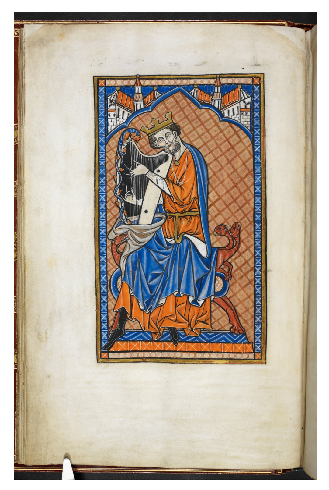
Figure 2: Add MS 50000 (Oscott Psalter), f. 15v: David playing the harp. 1265–1270. London, British Library. Image: British Library. Licence: CC BY-SA 4.0.