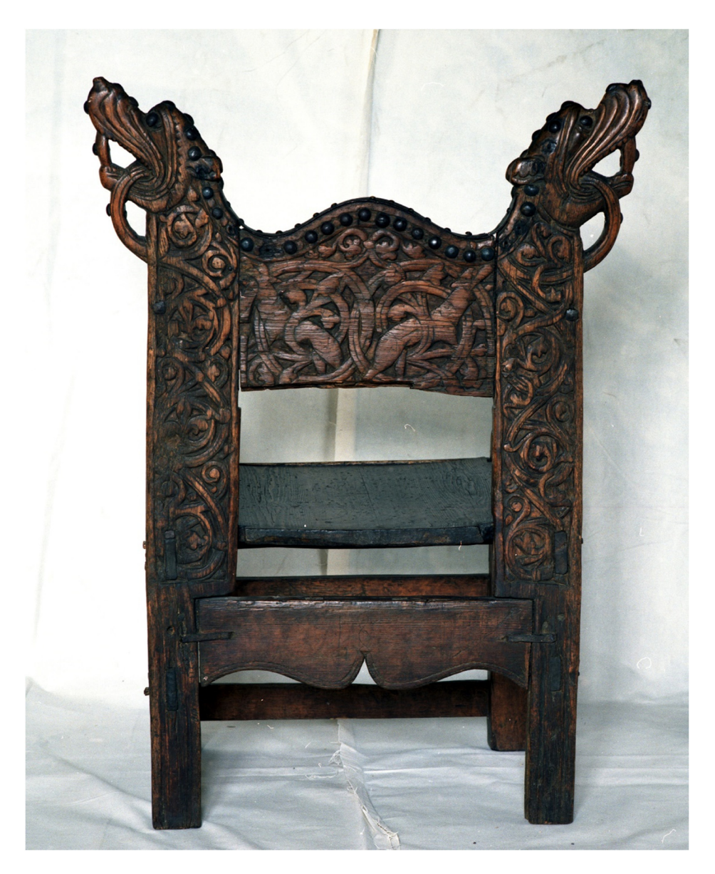
Figure 12: C26500: Gålås Chair back rest. 1200. Oslo, Kulturhistorisk Museum. Image: Eirik Irgens Johnsen. Licence: CC BY-SA 4.0.

architecture and related items. While using such items as inspiration, it appears likely that the origin of text-related iconography in Icelandic book painting was established on the basis of cultural syncretism, where both the method of interpicturality and, at times, a good understanding of the text to be illuminated played particular roles. Due to the fact that few of the texts featured in the illuminated manuscripts had previously been illuminated, a rather innovative approach was taken by the Icelandic book painters to provide the texts with illuminations that contained both text-related and iconographic features known from other genres and with different moral exegeses. Overall, the iconography discussed in this article is perhaps best understood in relation to the syncretistic-cultural frames in which it was created and the variety of visual and textual inspiration on which it is based. By investigating both the cultural–historical frames of the book paintings and the more immediate relations visible in the text-image and image-to-image connections, we acquire a better and deeper understanding of the working techniques of the Icelandic illuminators. By investigating both the cultural framework and the working techniques as integral requirements for both the book paintings and the texts featured in an illuminated manuscript, new and interdisciplinary