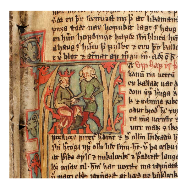
Figure 6: GKS 1005 fol. (Flateyjarbók), f. 76r: Haralds þáttr hárfagra. 1387–1394. Reykjavík, Stofnun Árna Magnússonar í íslenskum fræðum. Image: Jóhanna Ólafsdóttir. Licence: CC BY-SA 4.0.