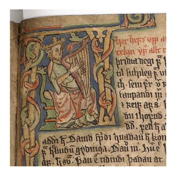
Figure 4: AM 226 fol., f. 88r: Stjórn. 1350–1370. Reykjavík, Stofnun Árna Magnússonar í íslenskum fræðum. Image: Jóhanna Ólafsdóttir. Licence: CC BY-SA 4.0.