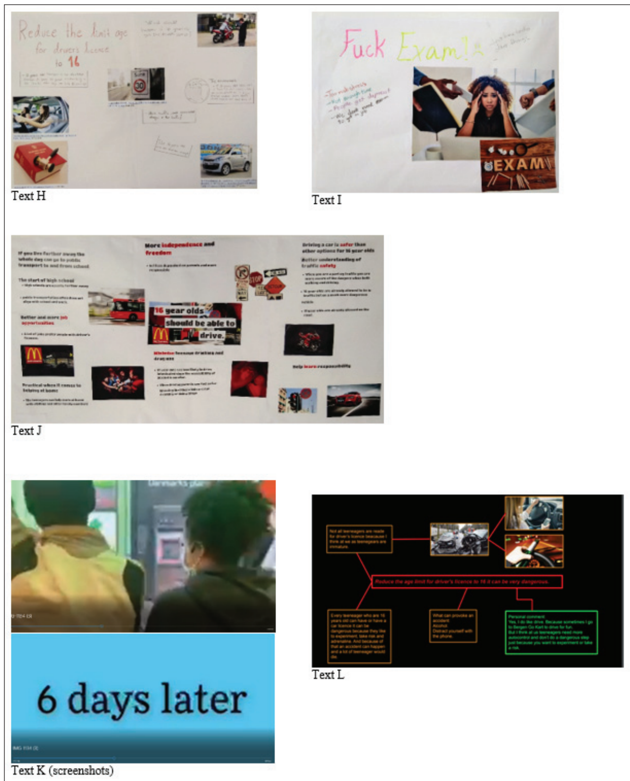
Figure 3 Facsimiles of multimodal texts, classroom intervention 2.

Both assessor groups considered good connection between language and visuals as important, as noted in their positive assessment of texts E and K. Text H received a less favourable appraisal, as the captions to the images were viewed as disconnected from the overall message of the text.