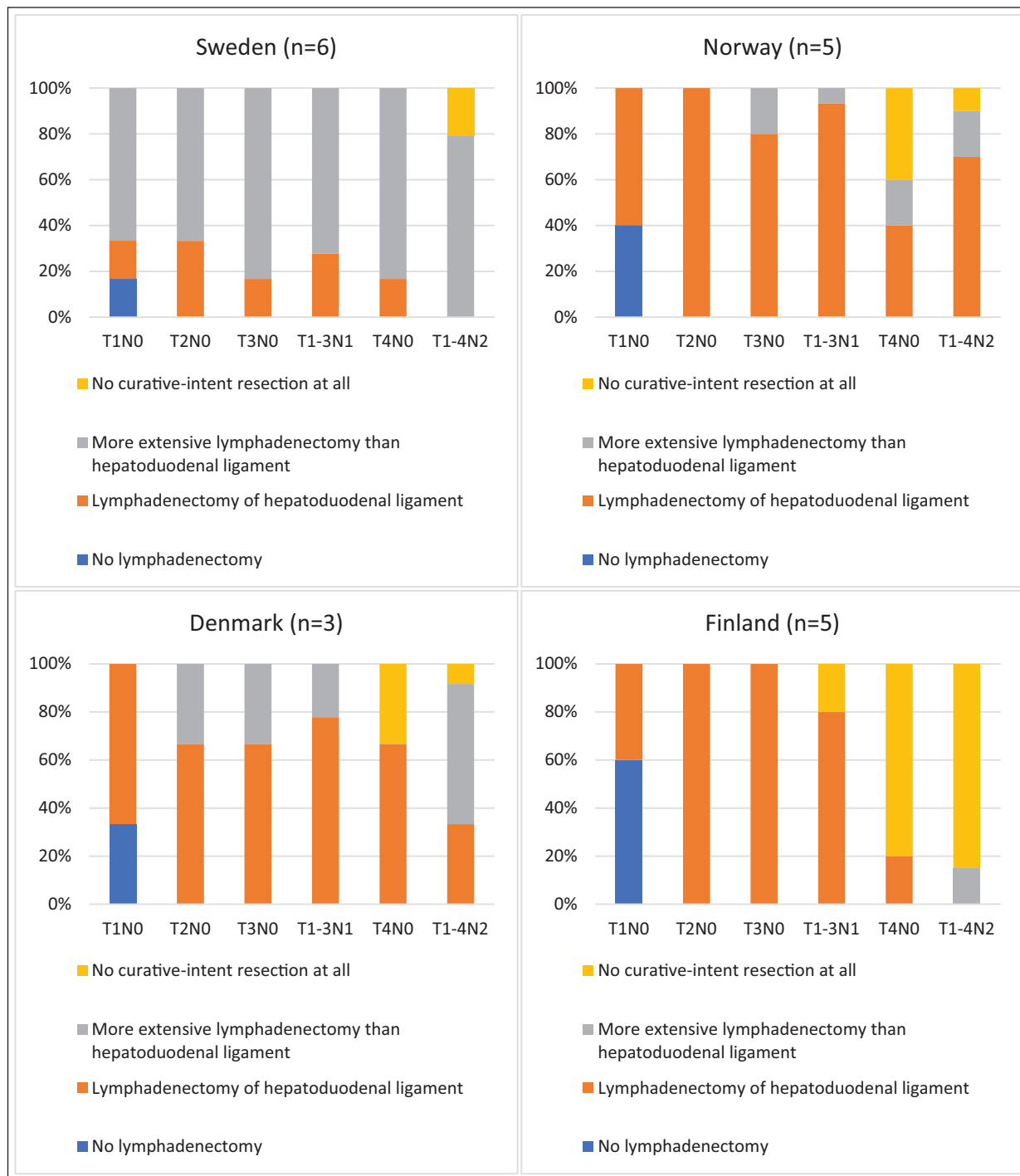
Fig. 2. Lymphadenectomy based on presumed T-status and N-status (clinical, radiological, or histological).

The current National Comprehensive Cancer Network guidelines (NCCN, 2022) 23 in the United States support the use of adjuvant chemotherapy and chemo-radiotherapy for GBC, regardless of R and N status. American Society of Clinical Oncology guidelines (ASCO, 2018) 24 also recommend adjuvant capecitabine for a period of 6 months for resected GBC patients. The Japanese Society of Hepato-Biliary-Pancreatic Surgery guidelines (JHBPS, 2019) 25