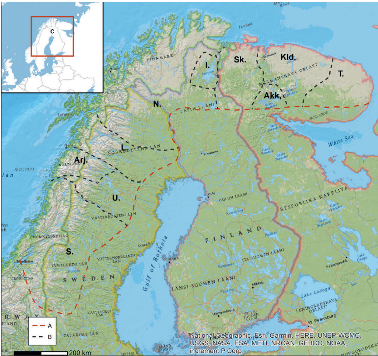
Fig. 2. The main dialect areas of Sami. A: extent of the Sami area of settlement (as depicted in most modern surveys, despite the fact that the South Sami language area, for example, extends to the Gulf of Bothnia); B: approximate borders of the main dialects of Sami; C: the area on the main map. Western Sami: S.: South Sami; U.: Ume Sami; Arj.: Arjeplog Sami; L.: Lule Sami, N.: North Sami. Inari Sami: I.: Inari Sami. Eastern Sami: Sk.: Skolt Sami; Akk.: Akkala Sami (extinct in 2003); Kld.: Kildin Sami; T.: Ter Sami (after RYDVIING 2004b, 358; map GIS department, ZBSA).