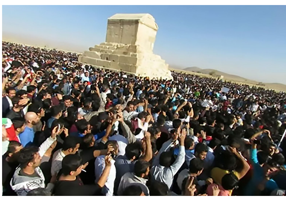
Figure 1 Image circulating online of Iranians chanting at the Pasargadae, the tomb of Cyrus the Great, October 28, 2016. [Color figure can be viewed at wileyonlinelibrary.com]

using Persian words that indicate a step away from Arabic-Islamic influences, and getting tattoos with Zoroastrian symbols. (Note that tattoos are forbidden according to orthodox interpretations of Islam—and nor are they common in Zoroastrianism, either.) There is a great interest in sharing certain Zoroastrian celebrations, but the government has repeatedly put restrictions on participation by non-Zoroastrians. For instance, access to the mountain shrine of Pīr-i Sabz is restricted during the annual pilgrimage festivities, and not all Zoroastrians are in favor of pulling down all social boundaries.