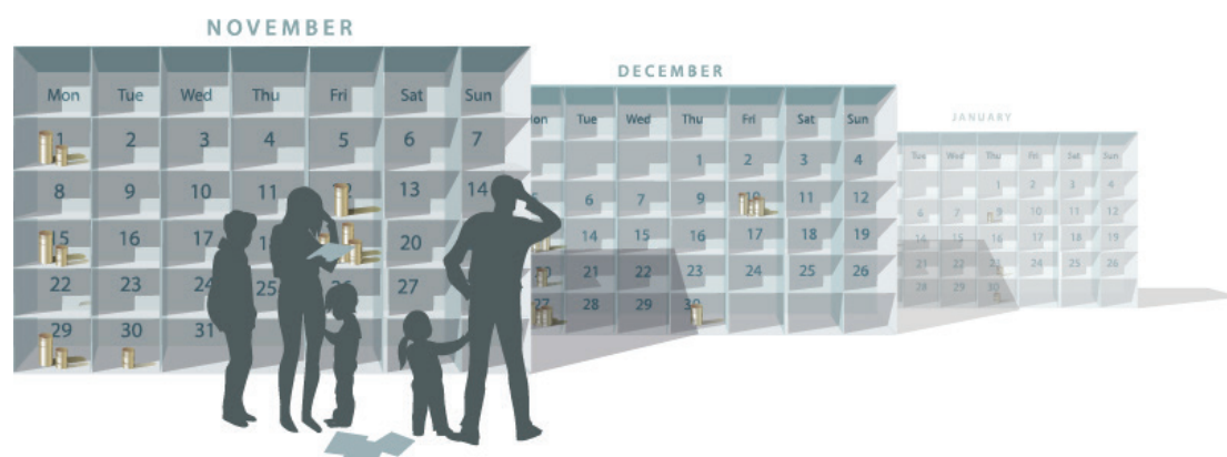
Figure 2. Illustration of the composite case and the complexity of the financial situation of the family

Notes: The figure visualises how income in one month may look for a typical family participating in the project. The stack of money illustrates how payments of various amounts are made at different dates throughout the month.