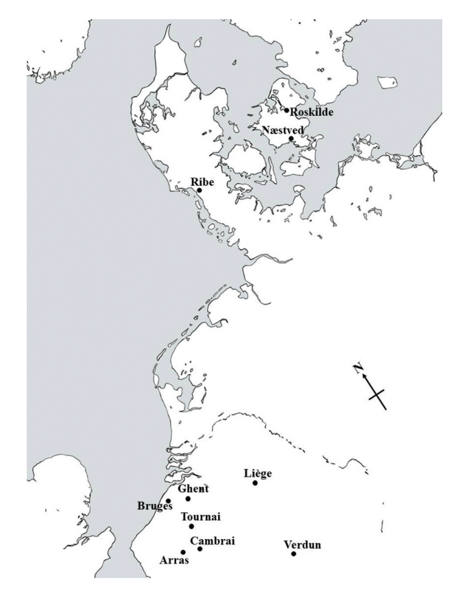
Figure 2. Map of the Low Countries and Denmark. (image created by Ben Allport).