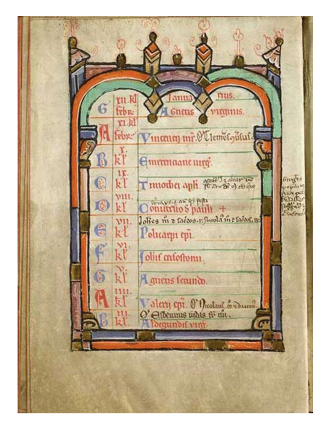
Figure 1. Copenhagen, Det Kongelige Bibliotek, E don. var. 52 2°, f. 14 v: the last days of January.

The Royal Library's catalogue presently dates the manuscript (excluding the later additions) to the period 1228–1250, a dating which also forms the basis of the discussion here.