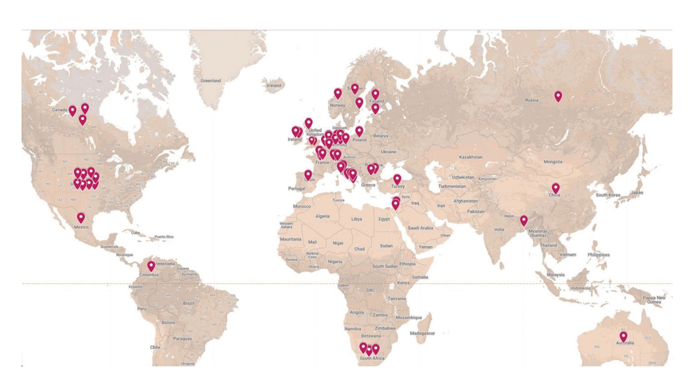
FIGURE 2 Geographical distribution of all responses, including the initial survey and the broader audience of the porphyria community, which included 63 responses from 26 countries. Each response was from either an individual expert or a collaborating group of experts.