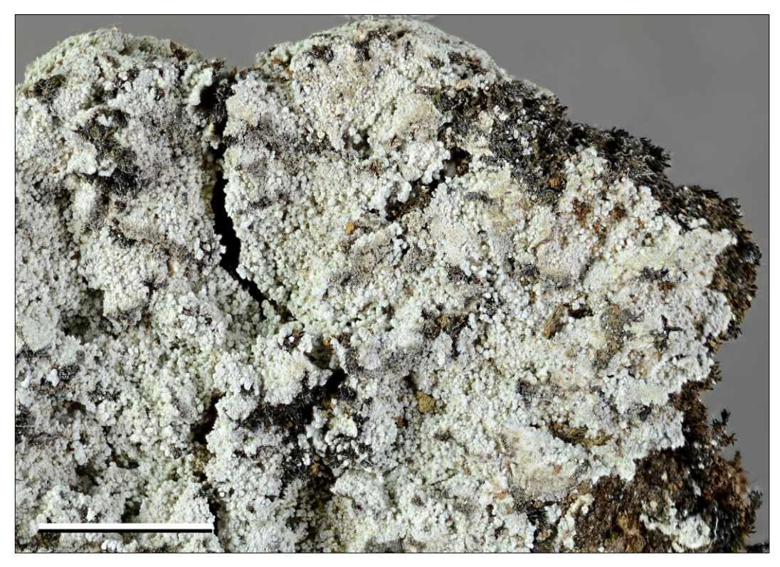
Figure 1 . Lepraria borealis . Herbarium photograph of the specimen from Gaupne (Lindblom 1360, O L-229230, GenBank OP554448). Scale bar = 5 mm.

(denoted " L. neglecta B" in Fig. 2), which is only distantly related to the L. neglecta group in Norway (denoted as " L. neglecta A" in Fig. 2). In other words, specimens identified to L. borealis appear in the two distant clades " L. neglecta A" and " L. neglecta B" in our phylogenetic reconstruction. Hence, results from this admittedly very small study show that Norwegian material determined to L. borealis is heterogeneous and that the clade " L. neglecta B" may represent an undescribed species. This result is supported by a comment by Vondrák et al. (2022, Supplementary Data S1): "Sequences of saxicolous and terricolous specimens of L. borealis are currently absent in NCBI database. (ITS Sequence from corticolous ' L. borealis ' recorded on bark of Populus tremula (Ekman & Tønsberg 2002) is a different species related to L. neglecta )". Regretfully, no barcode sequence from the type specimen of L. borealis is available, that could establish to which clade in our phylogenetic tree the name should be applied.