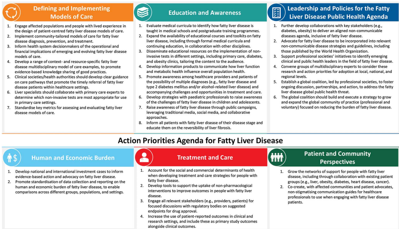
FIGURE 2 Action priorities to turn the tide on fatty liver disease.

the importance of action but the health and economic benefits of this.