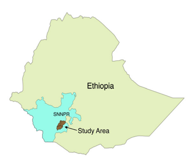
Fig 1. The map of the study area within southern Ethiopia.