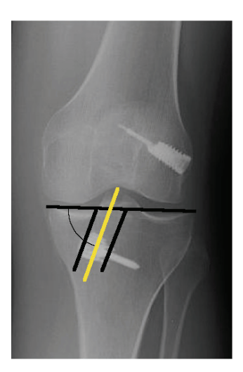
Figure 3 – Assessment of the steepness of tibial tunnels was done in the coronal plane

Results: Mean tunnel placement along the AJ-line was 46% (SD 5) and the mean tunnel inclination was 71 degrees (SD 4). When assessing whether the tibial tunnel had any signs of impingement, eight patients were found to have moderate impingement; but no patients were found to have severe impingement. No differences (n.s.) were found in the subjective scores or clinical findings (n.s.) between patients with moderate impingement and patients with absent impingement.