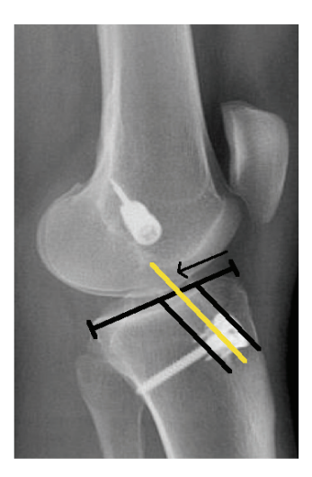
Figure 2 – Sagittal assessment of the AP-position of the tibial tunnels along the Amis and Jakob line