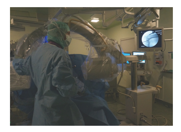
Figure 5 – Intraoperative use of fluoroscopy to secure femoral tunnel placement using a common fluoroscopic device and a generic template for tunnel position

efforts to reduce surgical error has driven the evolution of computer assisted surgery (CAS) – which has been explored extensively and is found to reduce levels of misalignment in procedures such as knee replacement [21, 165]. A recent costeffectiveness assessment from Margier et al., evaluating computer assisted navigation in ACL surgery, found an effect on reducing operating times in junior surgeons, but no clinical benefit at 1-2 year follow-up evaluation [131]. In that study, as in several other studies evaluating CAS, the added costs of equipment and extended time in the OR prevents the technology from being cost-effective. In comparison, the use of intraoperative fluoroscopy adds very little cost and time to ACL surgery. The procedure described in Study IV, requires a standard fluoroscopic device (that is commonly available in most orthopaedic departments) as well as a template for comparison of the intraoperative findings to that of the ideal position (Figure 5). Although the current study did not record the time used on the fluoroscopic assist, it is – in the authors' experience – relatively quick to master the technique, and therefore only a few minutes will effectively be added to the operating time.