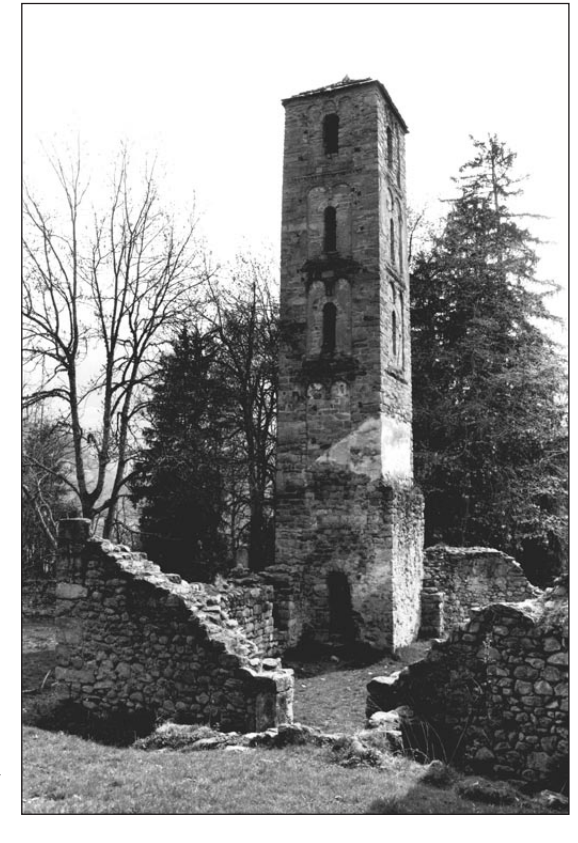
Figure 1. The ruins of the castle of Jörgenberg, in the Middle Ages ecclesiastical and manorial centre in the "Bündner Rheintal" (canton of Grisons).

Around 1740, the astutely observant Graubünden pastor, Nicolin Sererhard, attempted to describe the differences between the 'outland' and the 'core region'