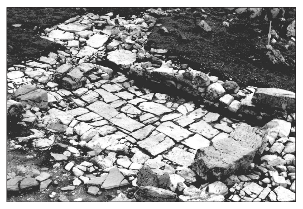
Figure 3. Ruins of an Alpine farmhouse after excavations, sixteenth century, Melchsee-Frutt (canton Obwalden).

There is no lack of examples of stonework ruins in the Mountains. In the Alpine regions of Mülibach in the Glarus lands, one can still see ancient huts, specially walled and which lean adjacent to rocks. They are called "Heidenhäuslein", which are possibly the oldest ruins in our country. However, it is also possible that these structures were used by valley inhabitants as safe havens, which served as protection from the attacks of the Goths as they moved through our land.