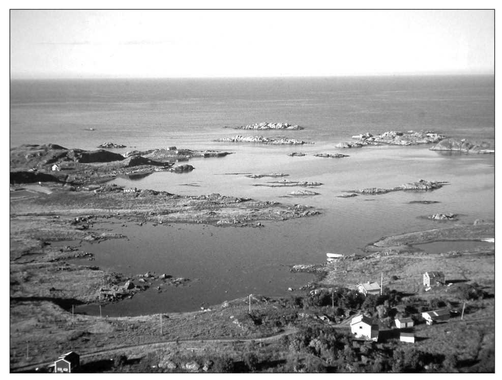
Figure 2. Photo of Langenesværet

others are medieval or later. Langenesværet was a maritime settlement long before the commercial fisheries flourished in the high Middle Ages. It is perhaps a similar type of settlement to Toften, but with a much longer settlement period.