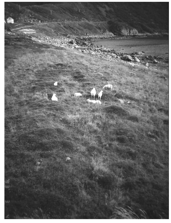
Figure 3. Photo of Skåltofta

If we shall consider these settlements as farms, they basically consist of tun and utmark. There were two kinds of utmark. On shore, we find the mountain slopes, which probably gave grazing land for sheep and goats, as well as being huntinggrounds with possibilities for collecting different kinds of plant material for food and fire-wood. The sea also offered a wide range of resources. Judged by the bone lists of Bleik and Toften, a number of sea birds and sea mammals were hunted, but cod and other kinds of white fish were of greatest importance.