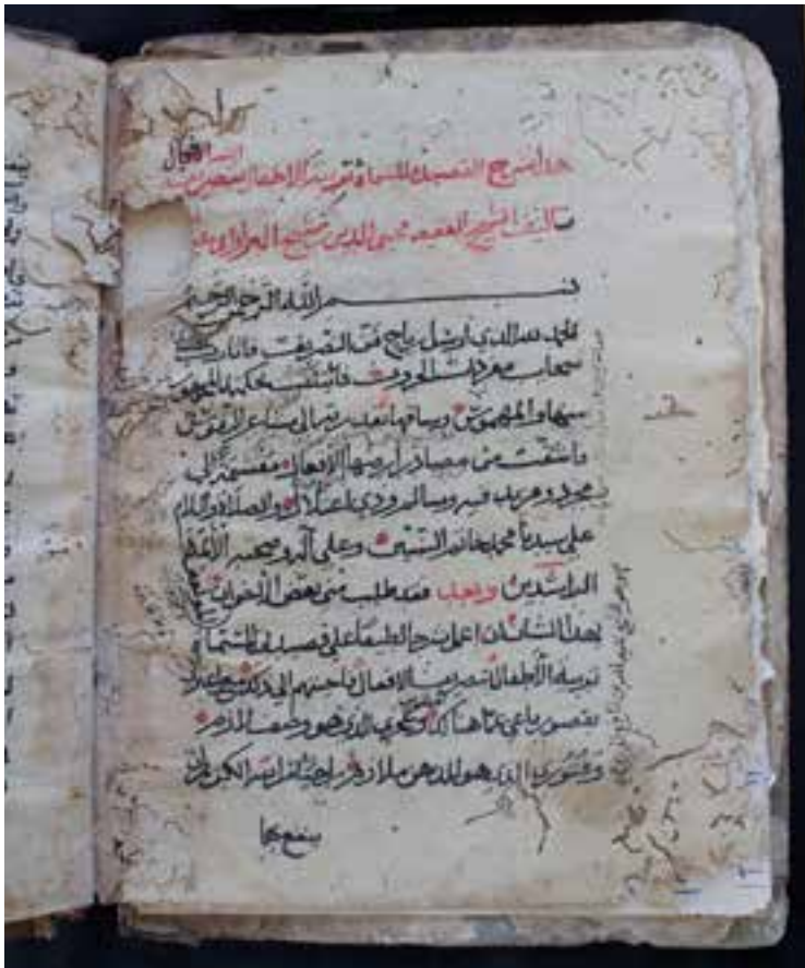
Fig. 5.1 First page of Sharḥ Tarbiyyat al-atfāl by Muḥyī al-Dīn al-Qaḥṭānī (d. Zanzibar, 1869). Possibly in the author's own hand (EAP466/1/38, image 3), CC BY-ND.

Lastly, the collection holds copies of texts authored by East African scholars themselves, sometimes in the author's own hand. One prominent example is EAP466/1/38 (Fig. 5.1) by the Brawa-born scholar Muḥyī al-Dīn al-Qaḥṭānī (ca. 1790-1869), Sharḥ tarbiyyat al-atfāl : a commentary on the text “ Tarbiyyat al-atfāl ” [ Instruction for children ]. Al-Qaḥṭānī was a renowned scholar on the coast.