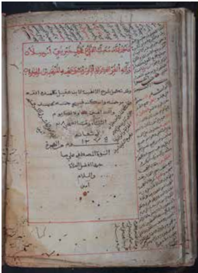
Fig. 5.6 Example of local copying in the nineteenth century. Alfiyya [The One Thousand, verse of 1000 lines] with marginal commentary by Ibn ‘Aqīl copied by Shārū b. ‘Uthmān b. Abī Bakr b. ‘Alī al-Sūmālī in 1858 (EAP466/1/15, image 574), CC BY-ND.

As in the case of ownership and purchase, we see in this list that scribes of diverse origin (Ḥaḍramī, Somali, Brawanese, Comorian — al-Qumrī meaning “The Comorian”) acted as copyists over a period of seventy years. It is also worth noting that the oldest locally produced manuscript was copied by a man of Somali origin (Shārū b. ‘Uthmān al-Sūmālī, Fig. 5.6). In other words, knowledge of Arabic and Islamic text was relatively widely diffused in terms of ethnic background. More detailed research to identify hitherto unidentified copyists and their background, as well as their other roles in society, will undoubtedly give further nuance to this picture.