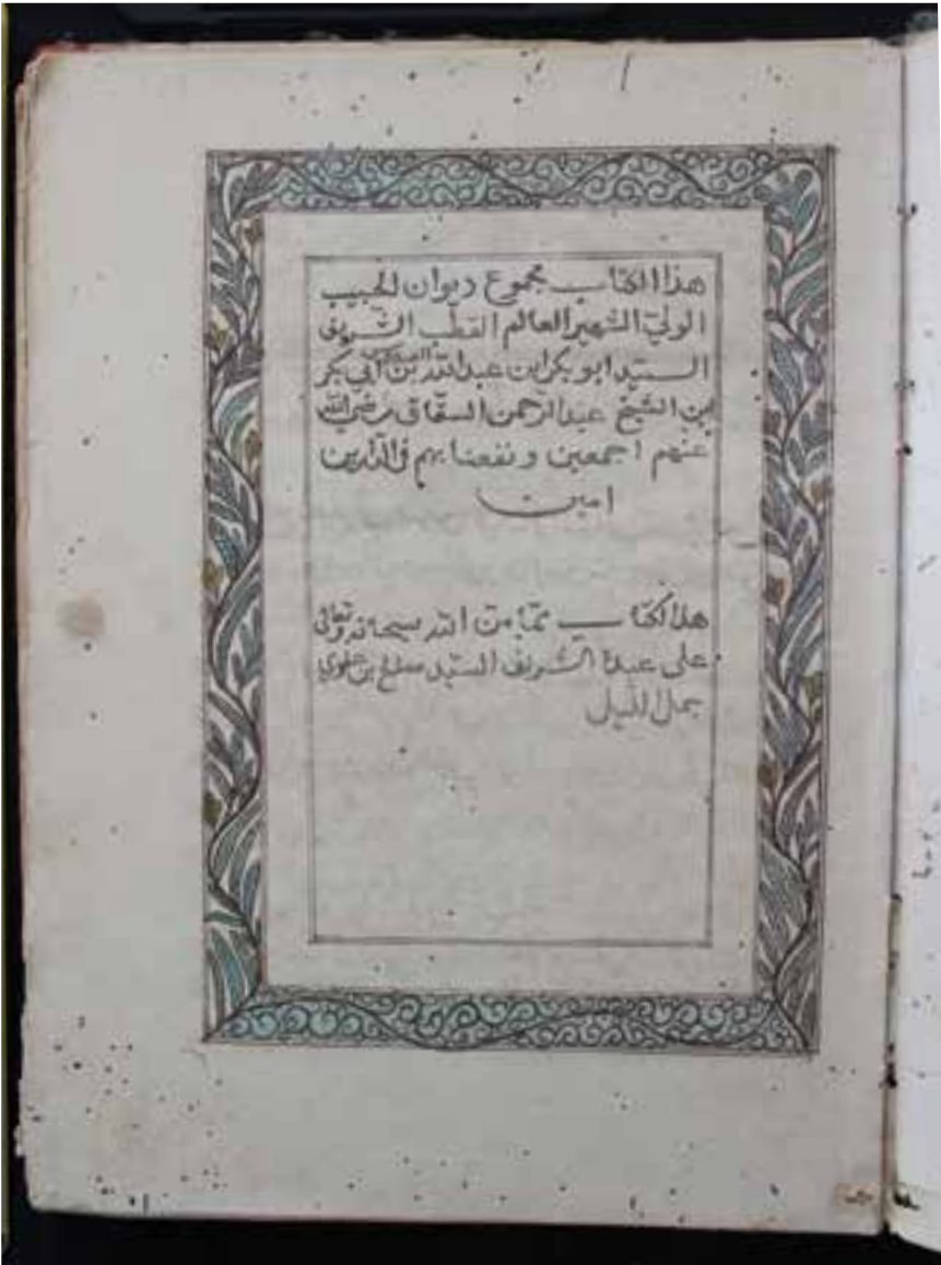
Fig. 5.7 Diwān al-‘Adanī [The Collected Poetry of Abū Bakr al-‘Adanī], copied by Sālim b. Yusallim b. ‘Awaḍ Bā Ṣafar for Habib Saleh in 1927 [1] (EAP466/1/19, image 2), CC BY-ND.