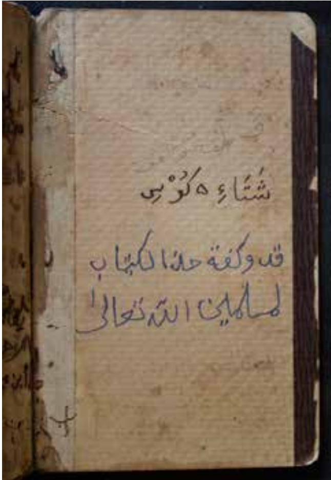
Fig. 5.3 Example of late waqf donation “for the benefit of Muslims”. Notebook with compilation of prayers and adhkār (Sufi texts for recitation) (EAP/1/106, image 2), CC BY-ND.

of the Riyadha, which curiously is not found in any other manuscripts (but generally in the printed works held by the institution).