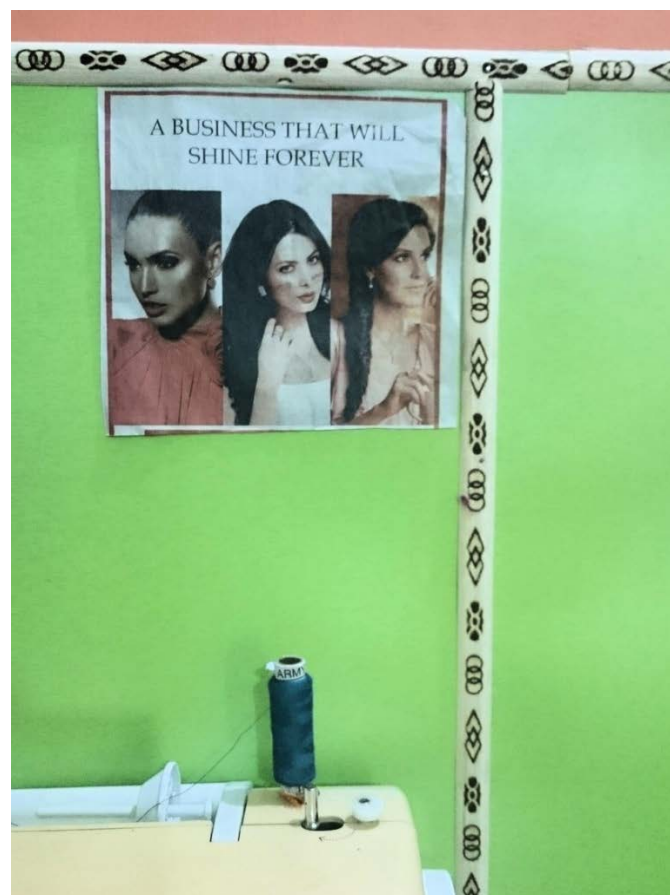
Scene from the working room. A newspaper clip advertisement reading: "A business that will shine forever".