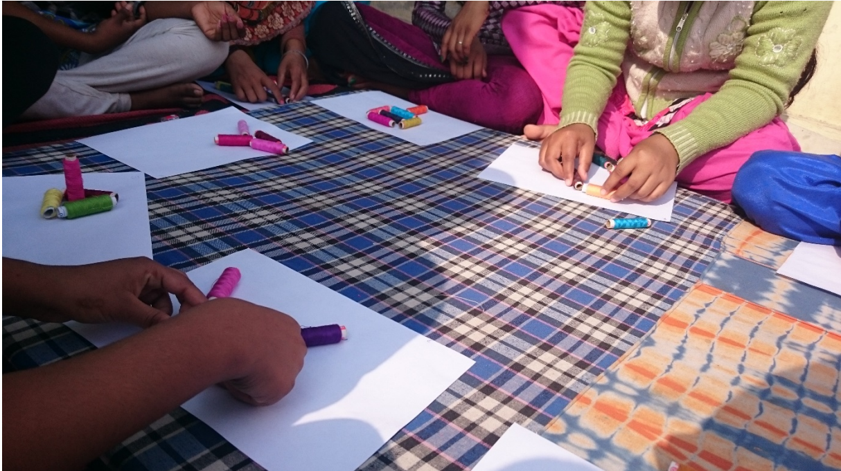
Scene from the “Creative workshop”: Myra (not in the picture) instruct the seamstresses on how to make designs out of threads and spools.

“expression” that Myra was seeking also constituted a claim to a certain authenticity in the end-product. Authenticity is “[...] that quality that somehow connects the commodity to a place or time with special significance, often rooted in notions of tradition” (Smith 1996:506 quoted in Kuldova, 2016:181).