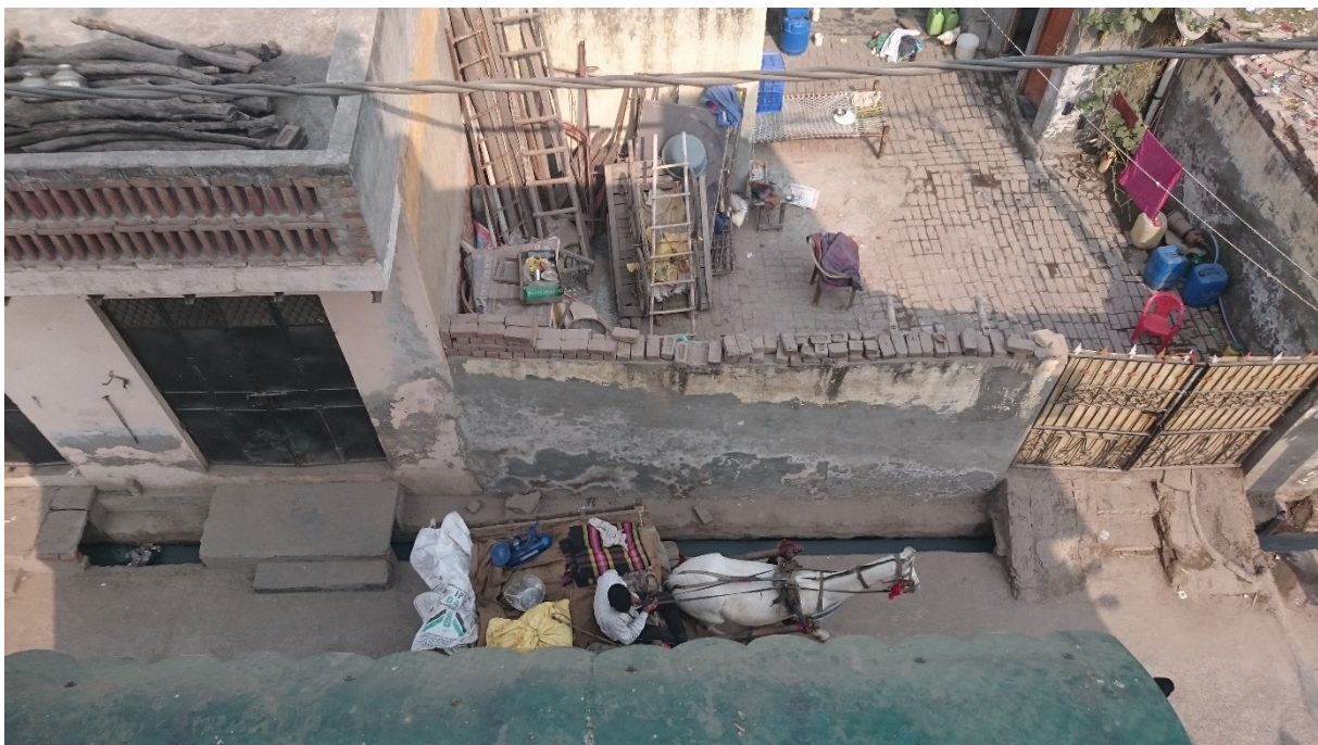
View from the Centre in Sundernagar, Sangampur. The Kamana community resides only one block away.

As my auto rickshaw turned off the main road after some time, the calm atmosphere of the narrow streets of Sundernagar in Sangampur, felt soothing. Sundernagar, the area where the Centre was located, was mostly residential. In between there were also a few small shops selling snacks.