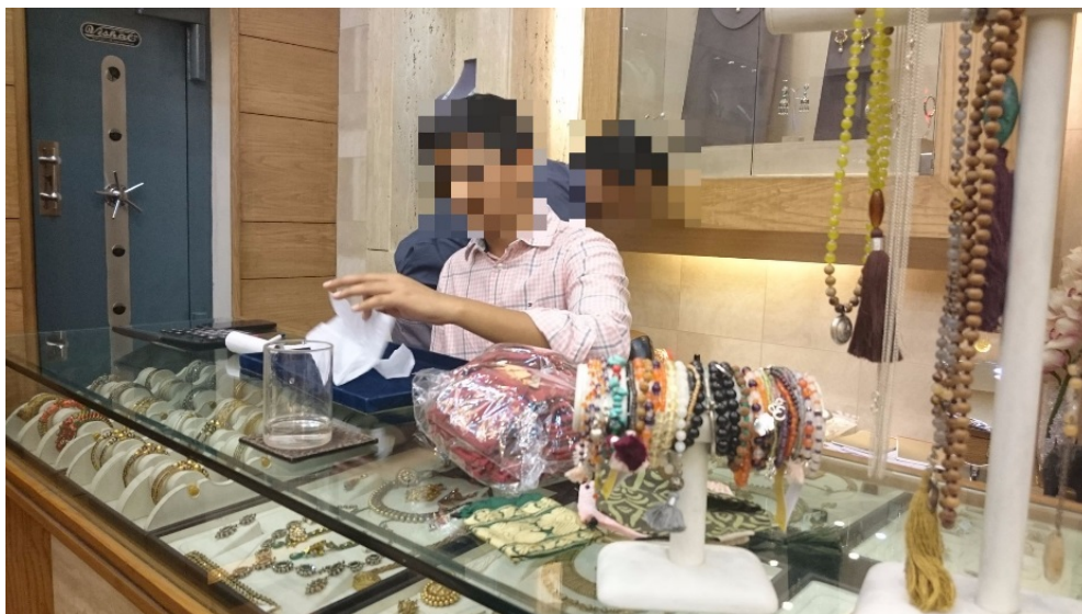
Scene from Shanti Jewellery shop. To the right in the picture Shanti Malas were displayed.

On another flyer that was put into the pouch with the product it was explained how they followed the principle of ahimsa (which may translate as non-violence, peace, do-no-harm) and thus “ no silk worm was harmed ” in the process of making threads for the malas . Further, the pouches were made with khadi fabric (handwoven cloth) and cords for an exact number of pouches, from artisans whom made the organic fabric and printed it by hand with vegetable dyes. Hence, the message is that buying that piece of expensive jewellery the purchaser is consequently contributing to making a better, more ethical, sustainable, moral and just world.