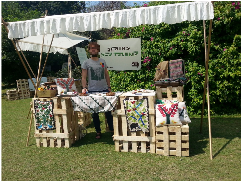
Early morning in the Diplomatic Area in South Delhi.

did not fit into the picture of a rapidly growing economy. As the news article says, the memories of a country suffering from chronic poverty had to be forgotten. This was a challenge in a city where “the streets linking upper class colonies” and embassies still are on “public streets where poor and rich mingle” (Waldrop, 2004:95).