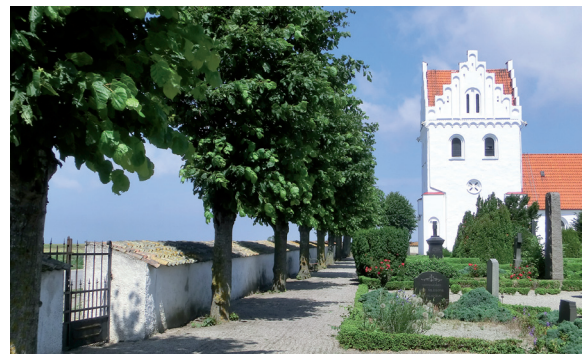
Figure 5. The largest bark population found, with approximately 200 thalli growing on bark of 22 Tilia sp. trees. The surrounding wall population is also very large (Table 1) (Skegrie church).

Our results support the hypothesis that establishment on trees are dependent of wall populations in close vicinity, continuously bombarding the suboptimal tree habitats with diaspores. The Mölleberga churchyard locality, where the churchyard wall has recently been whitewashed and the wall population are now without X. calcicola