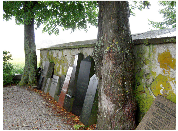
Figure 3. Two trees ( Tilia sp.) with X. calcicola growing close to the churchyard wall with a large X. calcicola population (Hofterup church).

we have observed ca 300 thalli of X. calcicola growing on bark. At six of the previously known localities, including one where it was reported relatively recently (Malmqvist 2000), the species was not found (Table 1). At all localities except one X. calcicola in addition to bark was present on the surrounding churchyard walls. The only exception was Mölleberga churchyard (Fig. 4B), where there were virtually no lichens on the wall, indicating that it had been recently whitewashed (Lindblom and Blom 2010). The wall populations at localities where X. calcicola grows on bark were, on average, larger than other wall populations ( 1706 \pm 2559 versus 489 \pm 1360 thalli), and a larger proportion of them possessed thalli with apothecia (71.4% versus 50.5%). Thus, localities with tree populations seem to have important source populations on walls in relation to localities with populations on walls only. Seemingly suitable churchyard trees were present at most of the investigated localities, indicating that colonization of X. calcicola on trees is a rare event. The trees harbouring X. calcicola were always growing close to the wall habitat, up to \leq 5 m (Fig. 3). These results add to the hypothesis that trees are actually suboptimal habitats for X. calcicola . Hence, bark populations are sinks (sensu Dias 1996) sustained by continuous supply of diaspores from the connected source population on walls (sensu Dias 1996).