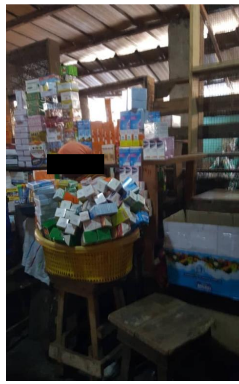
Figure 3. Woman selling drugs at Roxy market

As this study was aimed to investigate the reasons leading people to buy drugs from the informal market, Roxy market as the main focal point for this activity in Abidjan, was purposively selected. Roxy market, being the busiest informal drug market in Ivory Coast, made it ideal for accessing both users of these drugs and sellers and also to observe activities at this informal drug market.