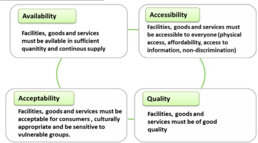
Figure 1. The four AAAQ criteria