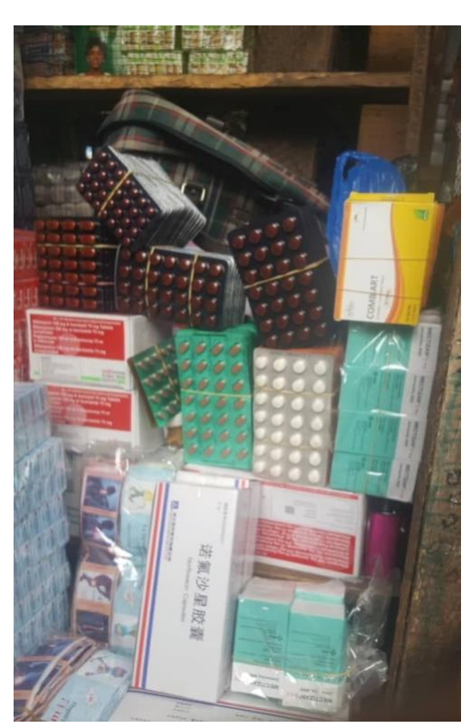
Figure 4. Drug stand in Roxy Market