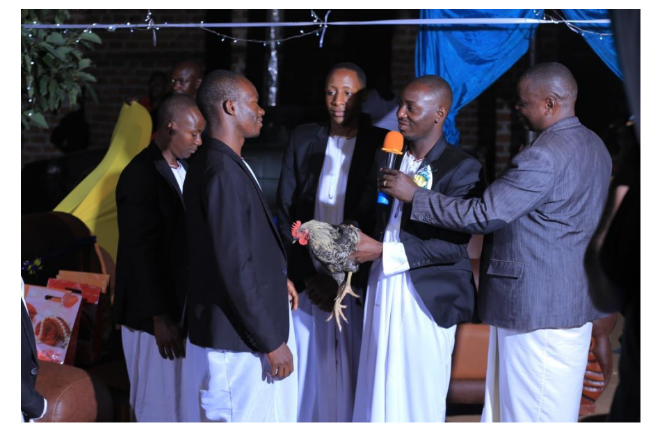
Photo 7: A photograph of a groom handing over a cock to the bride's brother

point. The picture below shows the bride's brother receiving the cock, while the groom asks him not to receive any from another man.