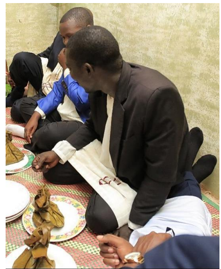
Photo 8: Photographs showing men served with 'oluwombo' delicacy after payment of bride price

friendships and partnerships ( muzanganda ), hence it is paramount that the groom and family eat steamed/dried coffee beans in the family where they have found a wife, to seal the friendship and partnership between the families. After eating, he (groom) attaches some money onto the dishes within which he was served as a token of appreciation to the people who prepared the meal. If he does not attach the money onto the dishes, he and his entourage are regarded as uncouth and ungrateful people who do not appreciate those that treat them well.