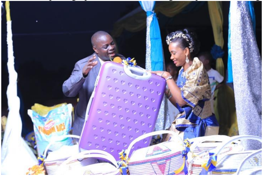
Photo 6: A photograph of a bride receiving her special suitcase/gift

There is a special suit case that is brought by the groom on that day. This and all its contents solely belong to the bride. It is usually, a gomesi , kikooyi , petticoat, and knickers that the bride wears as she goes off to her husband's place to commence her marriage. The groom can as well add other items as he pleases. But the rest of the items are for the parents to enjoy. (Rose 28, bride price paid in 2017)