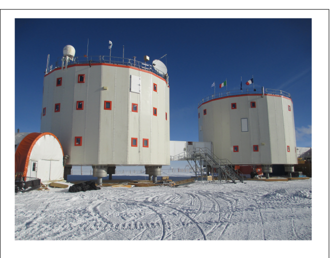
FIGURE 1 | Concordia research base in Antarctica.

The Concordia Station (see Figure 1 ) is a permanently crewed French-Italian research station located at an altitude of 3,232 m at Dome C ( 75^{\circ} 06' S, 123^{\circ} 23' E), 1,000 km inland from the coast of the Antarctic Ocean. The physical environment of the