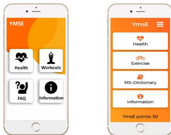
Figure 2. The entry menu and the landing page before and after the case study.

Both liked the colour orange for the applications since it is the MS colour. The font size was good, but the font family was not satisfactory. One meant that there could never be enough content, whilst the other meant too much information could make it hard to navigate through. Suggested improvements were to change the position of the menu and adding a MS-dictionary. In addition, shorter workouts were requested. Information on the medical exams could be compressed when appropriate (e.g. "read more"-button). One felt food recipes were unnecessary whilst the other wanted easy and quick recipes due to fatigue. They both disliked push notifications. Figure 2 displays the landing page and not additional content; the first version of the prototype was created based on the focus group findings, and the second version was implemented after the case study.