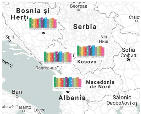
Fig. 2: The Western Balkan Online Library Platform (https://lnss-albania.libguides. com/c.php?g=665627&p=4714039)

Using this resource and platform, the project developed a host of resources, both in English and to be translated into the language of partners. Libraries in the Western Balkan region are now part of the international community Springhare, a unique global phenomenon of over 120,000 libraries from 80 countries.