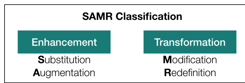
Figure 1 SAMR Classification Hierarchy

In an excellent review of research using digital media for mathematics education, Bray and Tangney (2017) offered an overall hierarchy (see figure 1) that seems particularly suited to the problematic nature of the field; it is called "SAMR - Substitution, Augmentation, Modification, Redefinition"