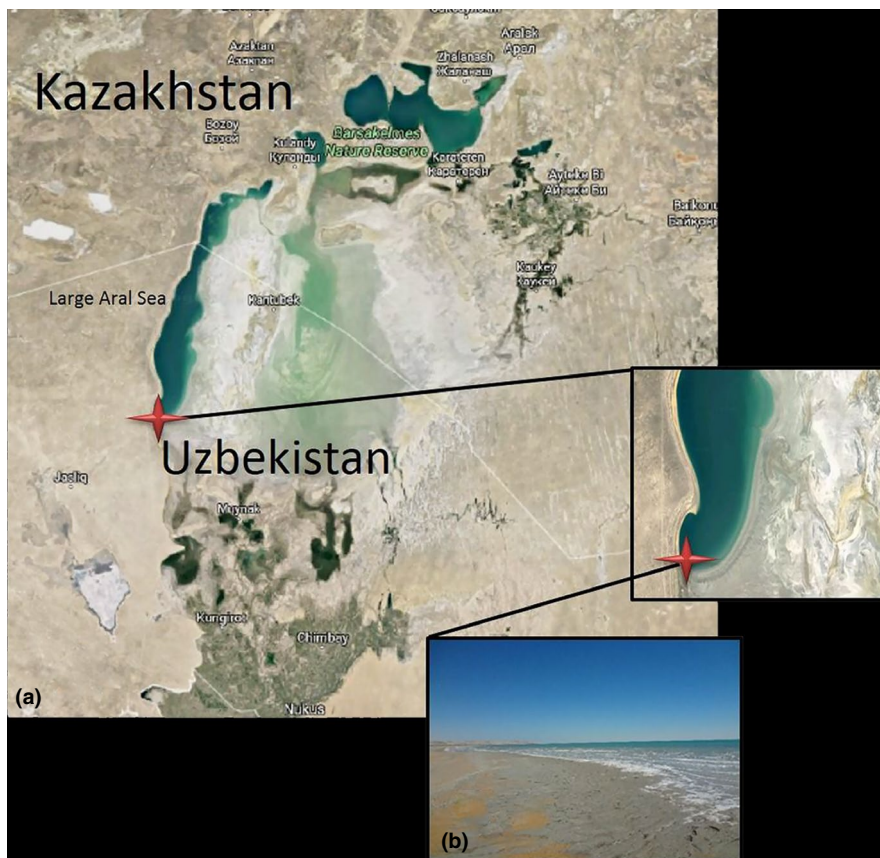
FIGURE 1 Location of study site. (a) Map of the Aral Sea in 2014 showing location of sampling site in the Large Aral Sea with red mark. (b) Close-up photograph of the Large Aral Sea beach where sampling was done (44°25'41.5"N, 58°14'34.7"E).

There are many reports on the salinity level, temperature fluctuations and physicochemical properties of the Aral Sea water basin (Gaybullaev et al., 2012; Izhitskiy et al., 2016; Rafikov & Mamadjanova, 2014). Although culture-dependent studies have been reported (Aripov et al., 2016), a comprehensive understanding of the microbial community composition and structure in the Aral Sea remains elusive. The aim of this work was to describe the prokaryotic community of the hypersaline Large Aral Sea (Uzbekistan) assessed by a culture-independent approach using 16S rRNA gene library analysis. This is the first prokaryotic diversity analysis of a changing hypersaline lake caused by human activities.