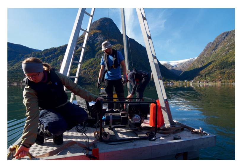
Fig. 2. One of the new projects based on the Hordaklim collaboration is Hordaflom, in which three of the six Hordaklim municipalities are partners. The aim is to reconstruct the past frequency of floods based on sediment samples from the bottoms of three lakes. This picture was taken during fieldwork in the Sandvinsvatnet lake near Odda.

After the project was initiated, it quickly became clear that the efforts required for coproducing the climate information had been severely underestimated. To add to this, the modeling efforts were hampered by technical problems and a gradual realization that the proposed methodologies were not as mature as was thought when the proposal was written. As a consequence, the new projections were not ready until a few months after the end of the project. Still, the pilot project was considered a success by the county and the researchers. Perhaps the most important outcome was the highlighting of the challenges that are the subject of this paper. The experiences along the way led to a gradual transformation into a truly interdisciplinary project in which natural scientists, social scientists, and county and municipal practitioners worked together in new ways. These new collaborations across disciplines and institutions have been important factors for securing funding for several