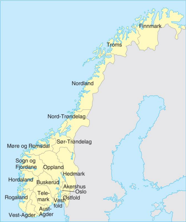
Figure A1: Regions within Norway