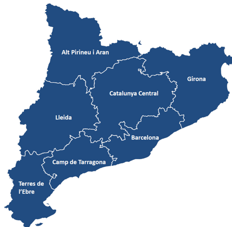
Fig. 2 The figure displays the seven health regions of Catalonia. The urban area of Barcelona (1.8 million citizens) has four health districts. The South-Eastern healthcare sector of the Barcelona city, which encompasses 520 k inhabitants, is Barcelona-Esquerra (AISBE). Taken from the Catalan Health Service (CatSalut) website. https://catsalut.gencat.cat/ca/coneix-catsalut/transparencia/territori/informacio-cartografica/mapes/ This is a public access image.

This protocol will take into consideration the entire population of healthcare users in Catalonia. The health system in Catalonia (7.5 M inhabitants) has three organisational levels, with the seven health regions at the top level (Fig. 2). Each region includes several geographical areas called health districts, second level, covering both specialised and primary care needs of the population. The third level corresponds to clusters of primary care centres within each healthcare district. The region has a