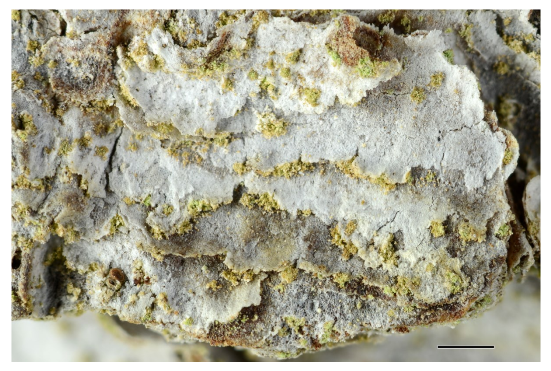
Figure 3. Miriquidica majae . T. Tønsberg 47835. Thallus with soralia on flaking spruce bark. A few apothecia of Lecanora cadubriae at bottom left. Scale 1 mm.

Habitat and distribution: Miriquidica majae has been found on Picea abies only. All specimens were from trunks. The trees were of the petticoat type (Fig. 1) and mostly with thick, rough and deeply furrowed bark. M. majae occurred on the outer surface of the bark and in the crevices. Associated species (found with M. majae on the bark pieces in the herbarium packets) included, e.g. Arthonia sp., Lecanora cadubriae (A. Massal.) Hedl. (the most common one), Lecanora phaeostigma (Körb.) Almb., Lecidea leprarioides Tønsberg, Protoparmelia ochrococca (Nyl.) P.M. Jørg., Rambold & Hertel, Pycnora sorophora (Vain.) Hafellner, and Toensbergia leucococca (R. Sant.) Bendiksby & Timdal. Other species occurring on the same trunks as Miriquidica majae included Calicium glaucellum Ach., C. viride Pers., Chaenotheca sphaerocephala Nádv., C. subroscida (Eitner) Zahlbr., and C. trichialis (Ach.) Th. Fr. In two localities (the type locality and Hotelltangen) Acolium inquinans (Sm.) A. Massal. occurred on trunks and/or branches of Picea abies . At the locality near the river between Kjerringvatnet and Storsvenningvatnet, branches of Picea abies supported Bactrospora brodoi Egea & Torrente and Cliostomum piceicola Holien & Tønsberg. The type locality supported pieces of wood of spruce with Pertusaria mccroryae C.R. Björk et al.