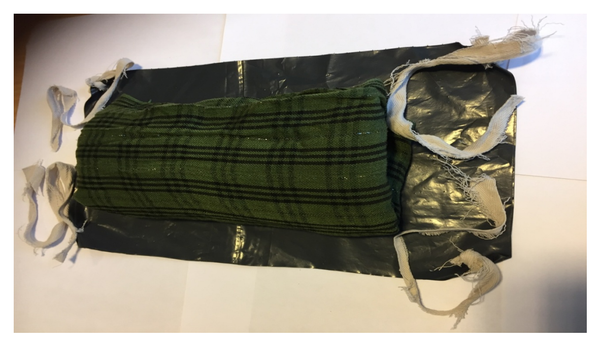
Figure 2. Showing a folded cloth pad on a water proof black plastic sheet. Picture taken with patient's consent.

Same strategies were used by participants with fecal incontinence, as one summarized: