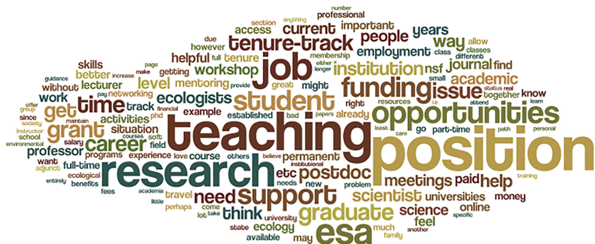
Fig. 3. Wordle diagram based on respondents’ comments received in the survey of contingent faculty in ecology. To generate the diagram, “faculty” and “contingent” were eliminated and “teach” was combined with “teaching.” The responses of postdoctoral fellows were combined with those of contingent faculty.

Another recurring theme was the importance for ecologists and institutions to be more inclusive in recognizing the diversity of career paths, particularly non-traditional ones, for this burgeoning mid-career constituency. Some ecologists choose to work in contingent positions for the flexibility offered, while others become contingent for family and other reasons. So, contingent faculty constitute a heterogeneous group within academia, with some permanently and others temporarily contingent, some by choice and others by circumstance. Contingent faculty often are stigmatized and without institutional support, while academia focuses on and grants privileges to tenured and tenure-track (i.e., salaried) faculty and early-career scholars. If academia is to make the best use of its talent, this mismatch between institutional priorities and the