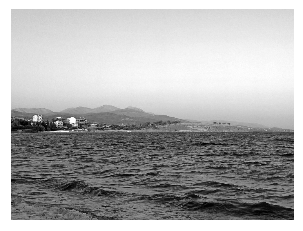
Figure 2. Lefkandi Xeropolis.