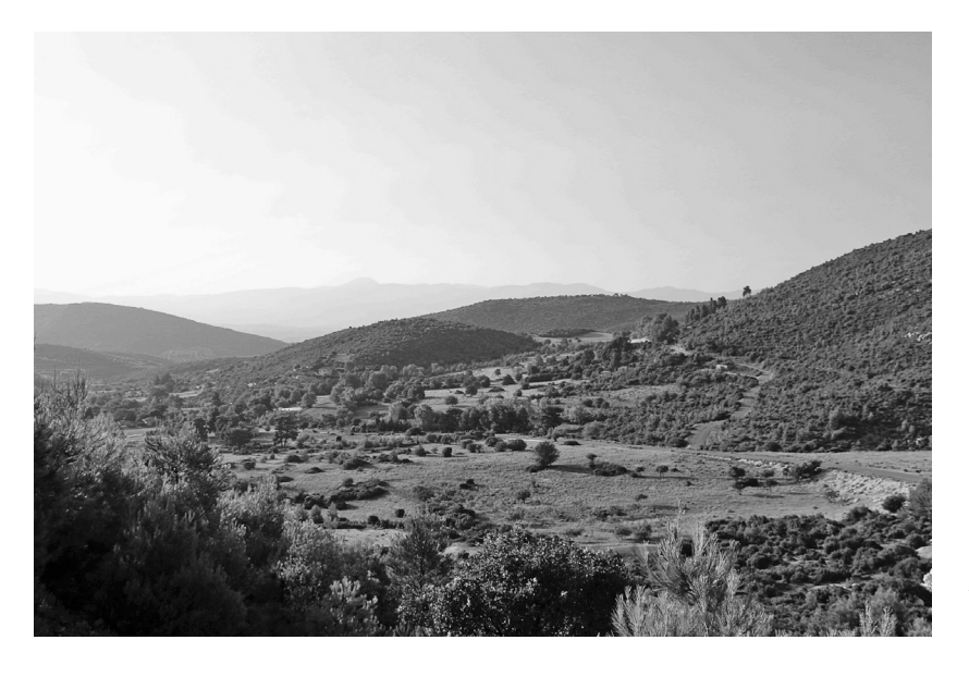
Figure 5. Gerontas hill, seen from the south.