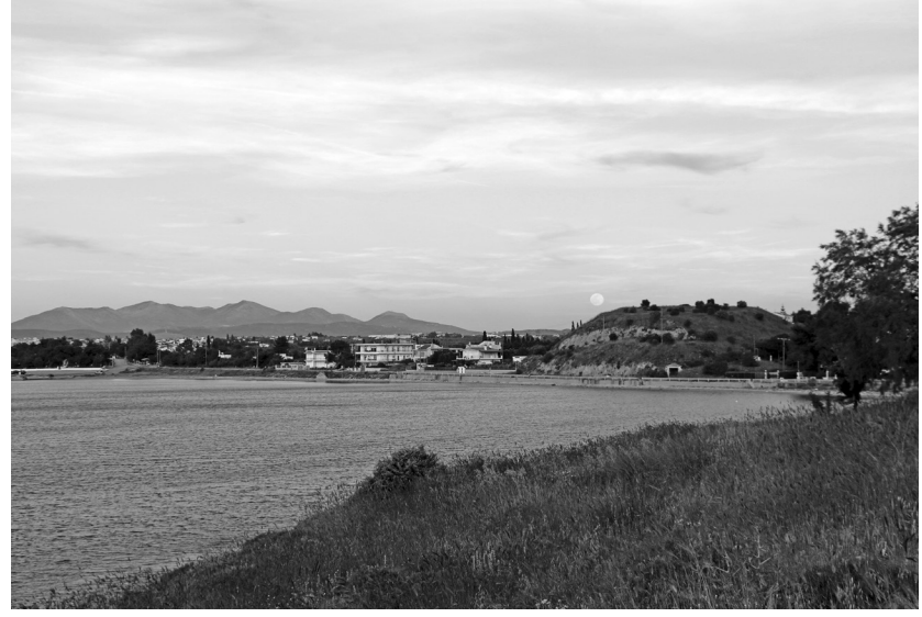
Figure 4. Salganea at Drosia.