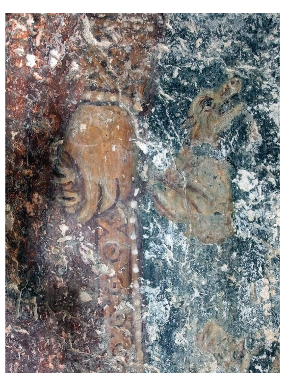
Figure 2. Naxos, Adissarou. Saint Mamas in the church of Agios Ioannis Theologos. Detail of the small lamb.