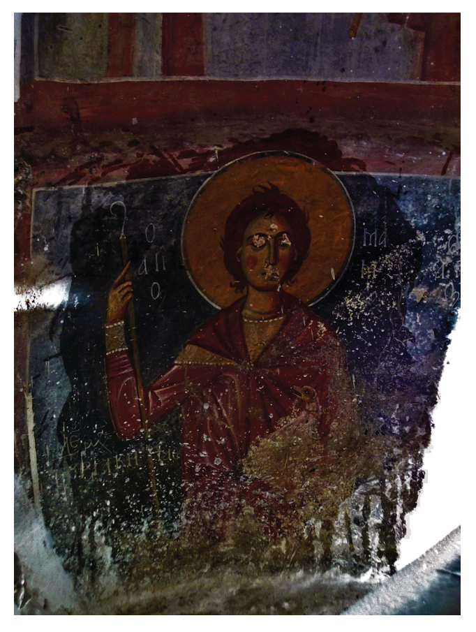
Figure 3. Naxos, Agiassos. Saint Mamas in the church of Panagia "stis Giallous".