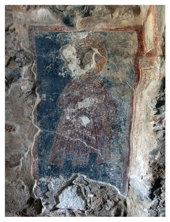
Figure 1. Naxos, Adissarou. Saint Mamas in the church of Agios Ioannis Theologos.