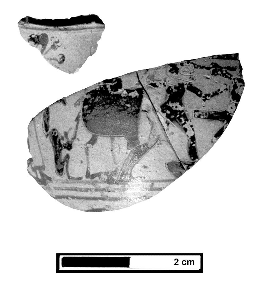
Figure 1. The sherds from the Middle Protocorinthian aryballos C-PC 72.