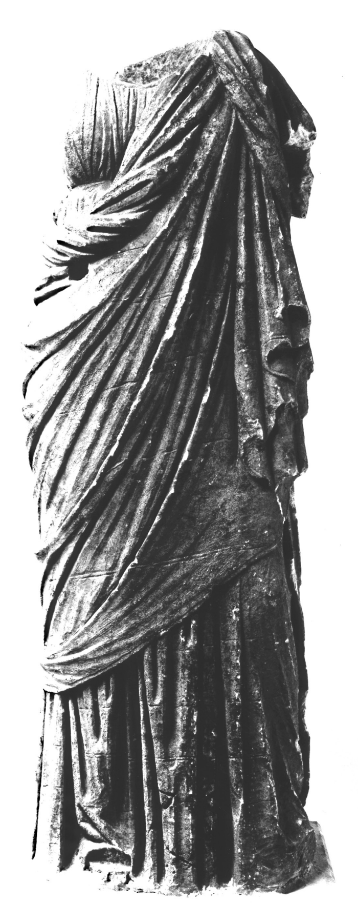
Figure 1. The statue, seen from the front.