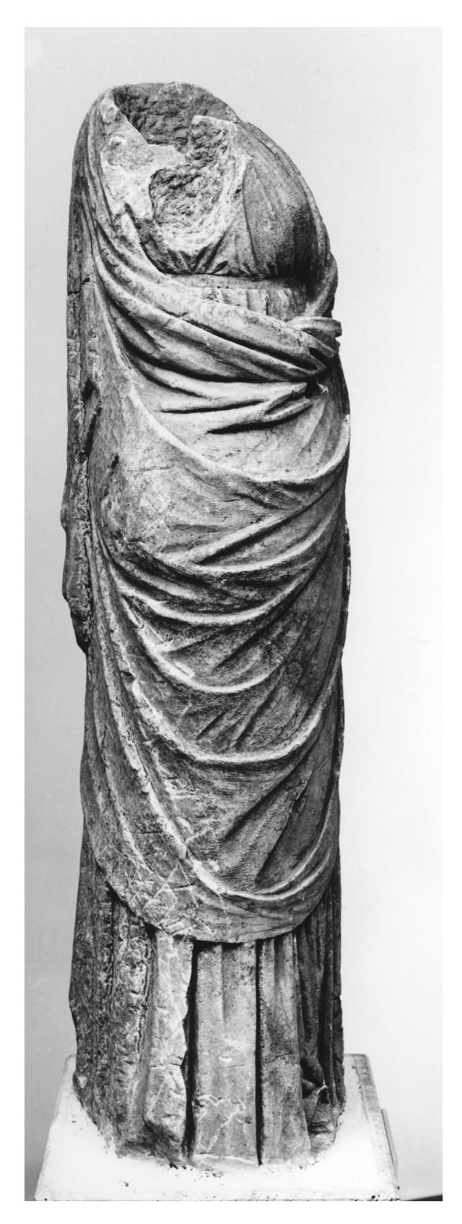
Figure 4. The statue, seen from the right.