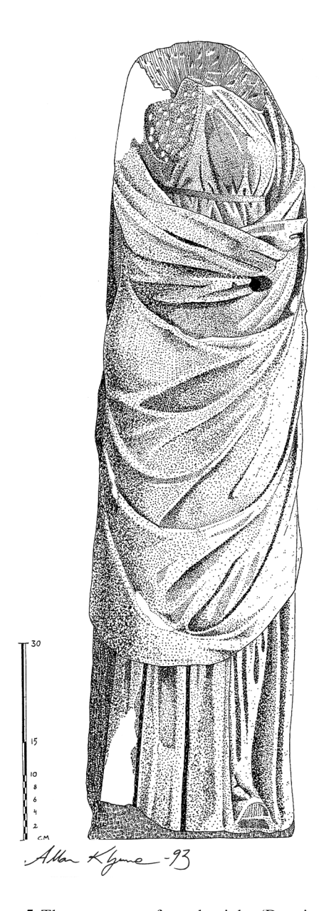
Figure 5. The statue, seen from the right. (Drawing: A. Klynne)