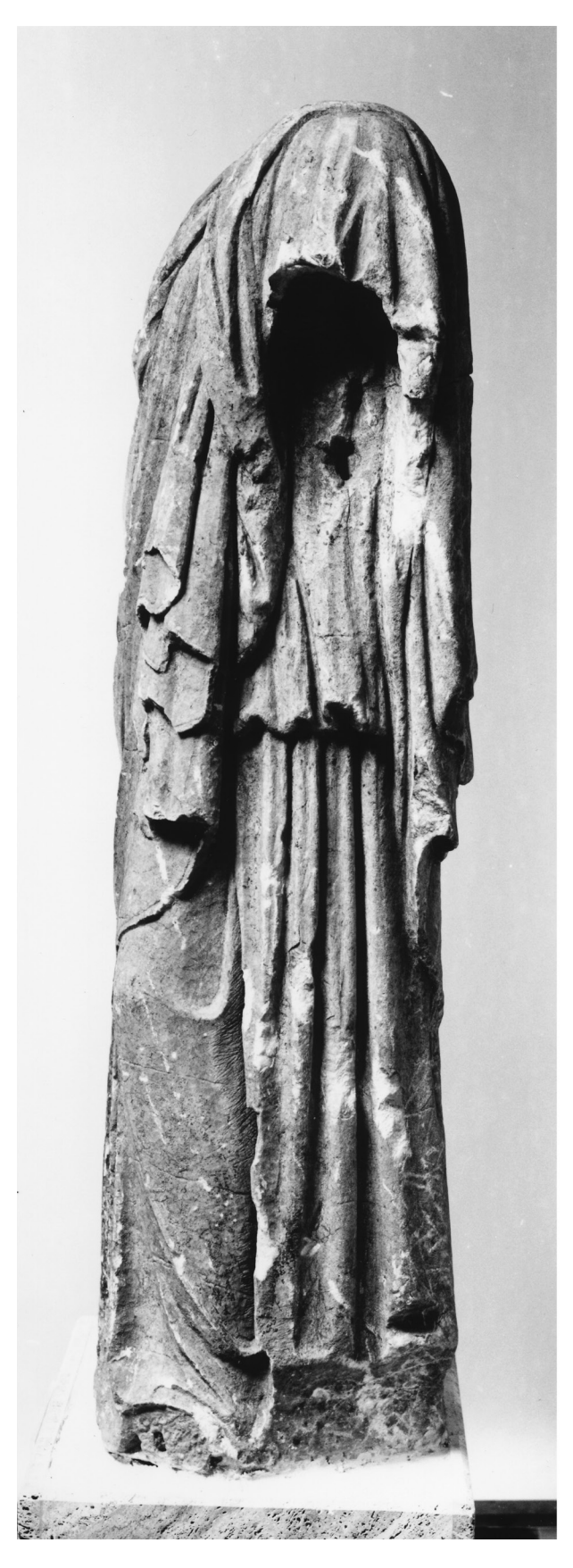
\label{eq:Figure 3.} \textit{The statue, seen from the left.}