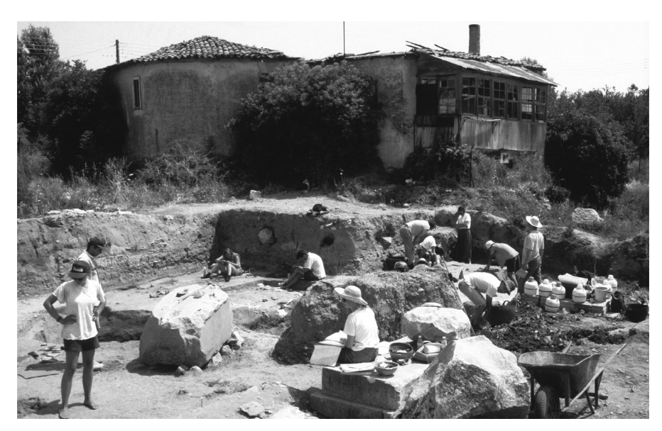
Figure 9. Work in the northern sector during the summer season of 1993.

into a large pit, which also contains marble fragments from the temple. In square C6, two parallel wheel-ruts left by a heavy cart lead to this pit over the surface from the south-west. Perhaps it brought material to fill the pit.