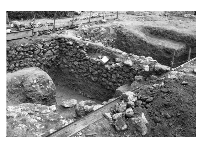
Figure 4. The excavation trench in the squares C-D 9-!0, in 1990.