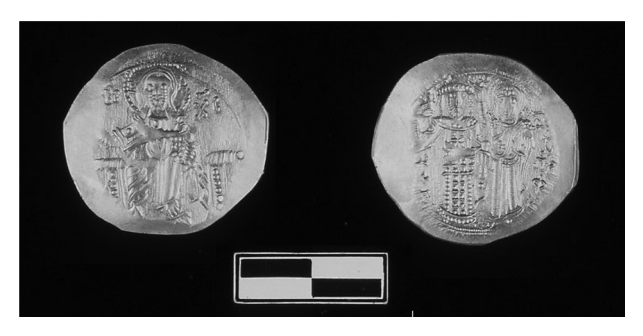
Figure 6. Byzantine gold coin (cat. no. Co 13 ) found in 1991 in the northern sector.