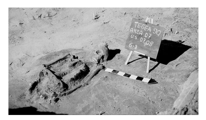
Figure 5. Medieval grave with skeleton ( Sk 1 ) found in the northern sector during the first season, summer 1990.