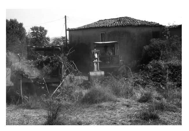
Figure 2. Machine removal of vegatation and dumps in the northern sector, before beginning the excavation in 1990. In the background, the ruined Demopoulos house.