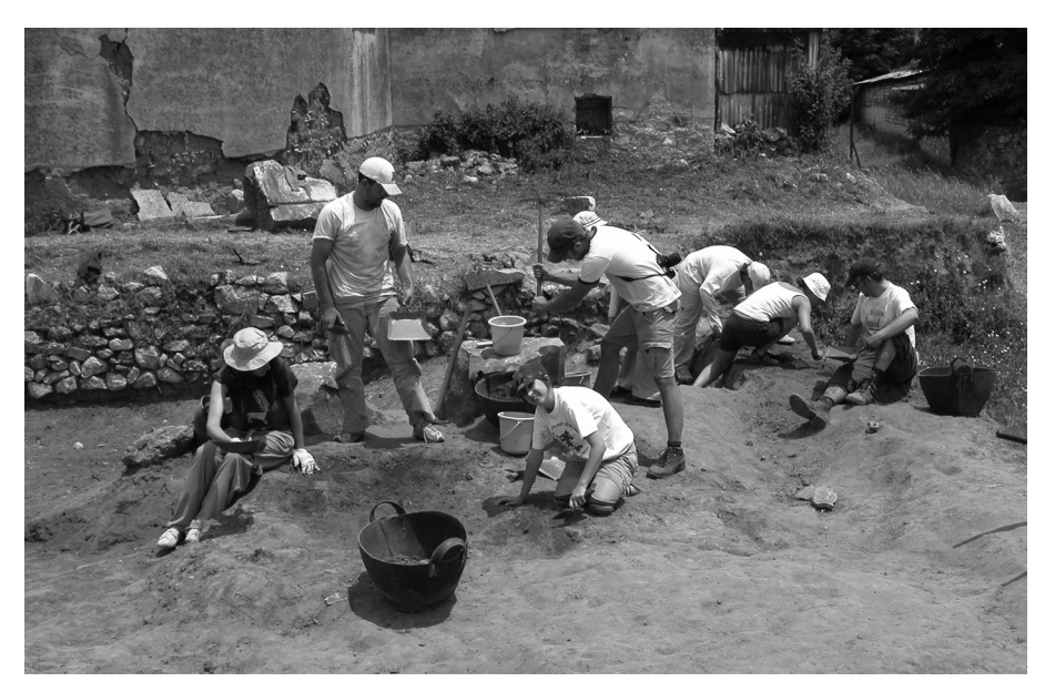
Figure 10. Italian, American and Norwegian students at work in the northern sector in July 2004.

certainly were.27 However, the area might have been important already at that time since it was so close to that natural spring or well which must have been an essential feature in the sanctuary as far back as it existed, and with which ancient traditions are so strongly connected.<sup>28</sup> Our excavation could only make very modest approaches to those early contexts, by drilling tests and by a very small sounding opened in square D6. The drilling tests went 2 m below the level of the 7th-century debris layer, and produced evidence for human activity at that depth; it is now certain that the layer of river pebbles which was encountered by the French archaeologists and considered by them as the virgin soil, is just one more trace of those flooding episodes created by the nearby river which covered thick cultural layers from earlier periods.<sup>29</sup> The four Early Helladic bronze pins which were recovered by us from secondary contexts (BrN-P 1-4) may give an idea as to how far back in time those layers may conceivably reach.30