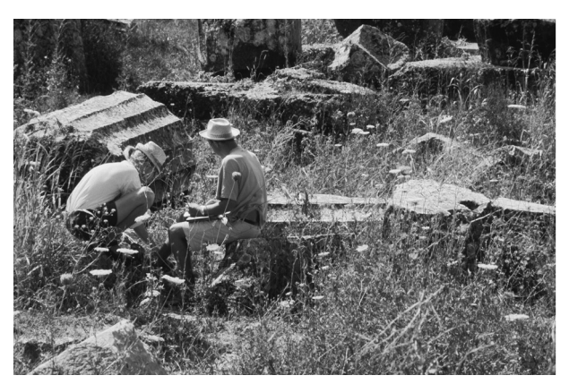
Figure 8. Work at the blocks from the Classical temple, summer 1993: Jari Pakkanen (left) and Øystein Ekroll.