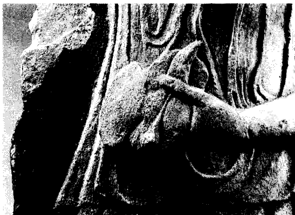
Fig. 3. Athens, NM inv. no. 226: detail, the liver.