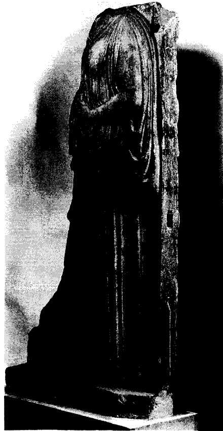
Fig. 2. Athens, NM inv. no. 226: general view, diagonal.