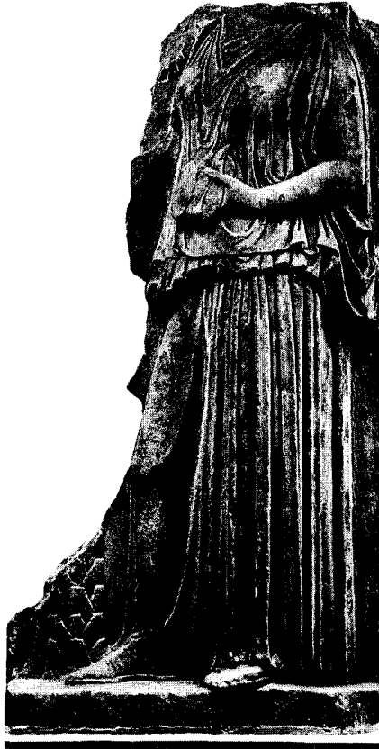
Fig. 1. Athens, NM inv. no. 226: general view, front.