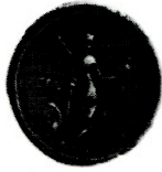
Fig. 8. Venus holding helmet and scepter. Roman coin of ca. 30 B.C.

artists were attracted by the motif and transformed it in accordance with their notions of gender. The arms became ornaments or spoils, taken by the goddess from her consort, and the motif was turned into an allegory of the power of love. In terms of gender, this meant the superiority of the female, but in a very restricted sphere.