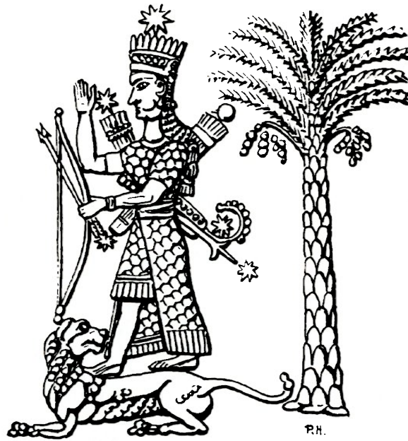
Fig. 1. Ishtar on an Assyrian cylinder seal.

images, of the armed Aphrodite in temples in Sparta and at Kythera, further a temple of Aphrodite Areia (Warlike Aphrodite) in Sparta, which contained xoana that were "as old as anything in Greece". He also mentions a statue ( agalma ) of the armed Aphrodite in a temple on the citadel of Corinth (2.5.1). We can therefore conclude that a cult of the armed Aphrodite existed in Laconia in early Archaic times, perhaps much earlier. We do not know exactly how the images looked, but most probably like palladia , i.e. standing female figures with helmet and shield and a spear in the raised right hand.