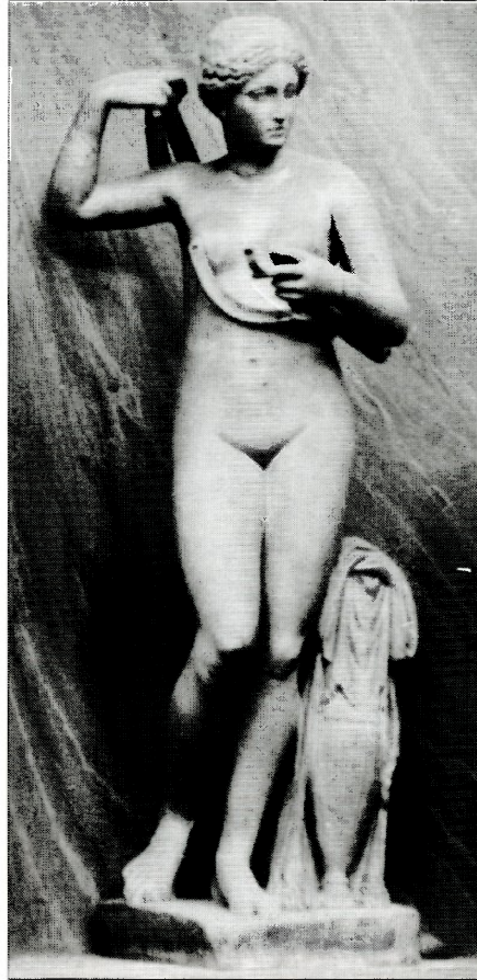
Fig. 2. Aphrodite putting on a sword. Marble statue in Florence, Accademia di Belle Arti. Height 1.23 m.

goddess of love and beauty, who conquers without weapons. If the sculptor got the idea of creating an 'armed Aphrodite' from the old xoana , he created exactly the same thing as the poets, changing a war goddess into the familiar love goddess and thereby reestablishing the normal gender roles of society. (One copy of the naked Aphrodite with the sword, which was found in 1974 in Nea Paphos on Cyprus, has a drawn sword in her right hand; this is obviously due to a change, perhaps made when the statue was repaired after being damaged in an earthquake.)