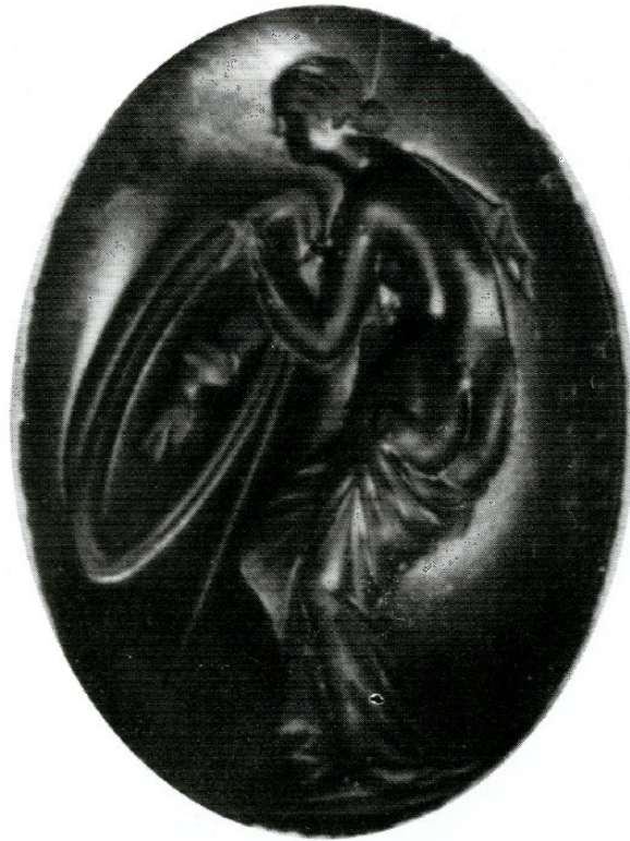
Fig. 6. Aphrodite arming herself. Impression of a garnet ringstone from Eretria. End of 3rd century B.C. Height 2.3 cm

The earliest representation of an armed Aphrodite to be considered here is the so-called Aphrodite from Epidaurus ( Fig. 7 ). The original can be dated ca. 380 B.C. and is likely to have been a Peloponnesian work. Unlike the representations mentioned so far, this is a more passive figure, carrying a sword in the way it is normally carried, hung on the shoulder. Dressed in a thin chiton that has slipped from the right shoulder, revealing the breast, and a mantel, the goddess is clearly characterized as a love goddess. Since the hands are missing