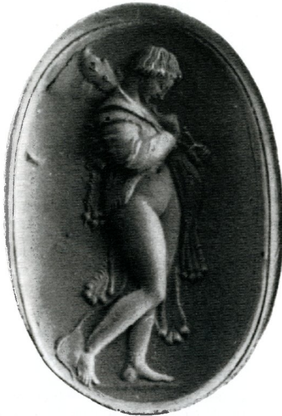
Fig. 3. Omphale with club and lion's skin. Impression of an amethyst seal. 1st century B.C. Height 2.45 cm.

It is, however, possible that the idea arose independently of the old images. Aphrodite was firmly connected with Ares since Archaic times and already in the fourth century a similar motif, Eroses playing with the weapons of Ares, is attested in the lost painting, known from literature, of the wedding of Alexander and Roxane by Aëtion. Further, in Hellenistic art the armed Eros is a not uncommon motif. A still closer parallel to the naked Aphrodite with the sword of Ares is afforded by Late Hellenistic representations of Omphale with the lion's skin and club of Herakles ( Fig. 3 ). The play with contrasts is an important element in Hellenistic art. In the case of the armed Aphrodite and Omphale, the contrast can be said to emphasize the traditional gender roles, but at the same time it makes the power of