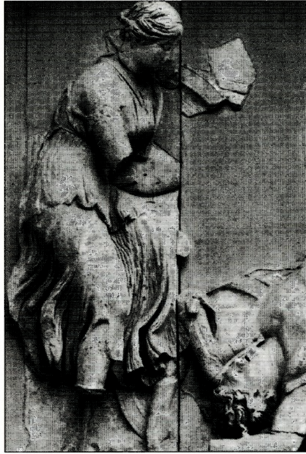
Fig. 4. Aphrodite in the Pergamon frieze. Ca. 170 B.C. Height ca. 2 m. Berlin, Pergamonmuseum.

the female apparent: both have triumphed over their lovers and taken their weapons, sword and club, as spoils. Thus a certain ambiguity is inherent in the motif.