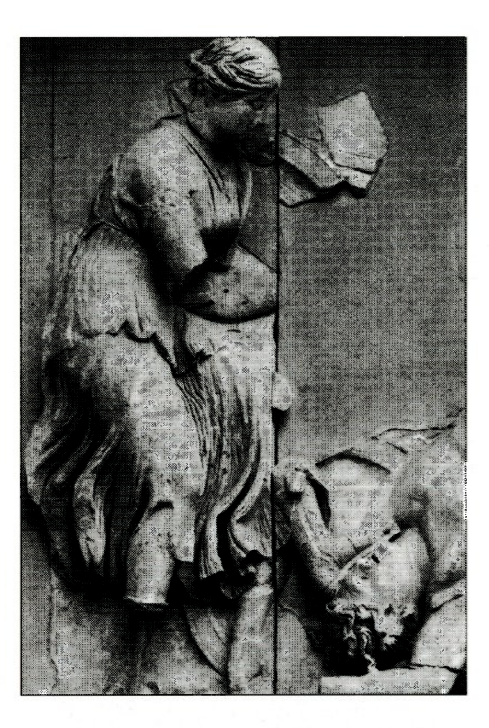
Fig. 4. Aphrodite in the Pergamon frieze. Ca. 170 B.C. Height ca. 2 m. Berlin, Pergamonmuseum.

the female apparent: both have triumphed over their lovers and taken their weapons, sword and club, as spoils. Thus a certain ambiguity is inherent in the motif.