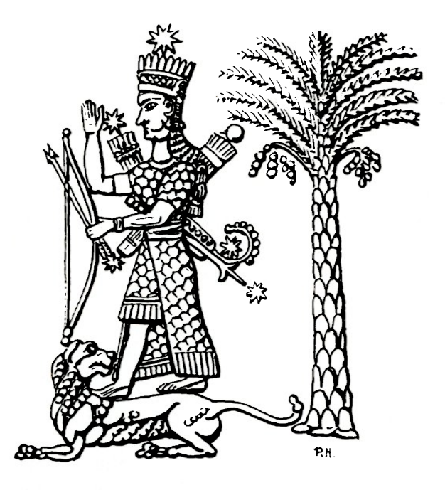
Fig. 1. Ishtar on an Assyrian cylinder seal.

images, of the armed Aphrodite in temples in Sparta and at Kythera, further a temple of Aphrodite Areia (Warlike Aphrodite) in Sparta. which contained xoana that were "as old as anything in Greece". He also mentiones a statue ( agalma ) of the armed Aphrodite in a temple on the citadel of Corinth (2.5.1). We can therefore conclude that a cult of the armed Aphrodite existed in Laconia in early Archaic times, perhaps much earlier. We do not know exactly how the images looked, but most probably like palladia , i.e. standing female figures with helmet and shield and a spear in the raised right hand.