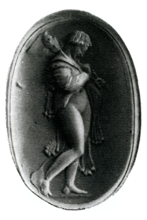
Fig. 3. Omphale with club and lion's skin. Impression of an amethyst seal. 1st century B.C. Height 2.45 cm.

It is, however, possible that the idea arose independently of the old images. Aphrodite was firmly connected with Ares since Archaic times and already in the fourth century a similar motif, Erotes playing with the weapons of Ares, is attested in the lost painting, known from literature, of the wedding of Alexander and Roxane by Aëtion. Further, in Hellenistic art the armed Eros is a not uncommon motif. A still closer parallel to the naked Aphrodite with the sword of Ares is afforded by Late Hellenistic representations of Omphale with the lion's skin and club of Herakles ( Fig. 3). The play with contrasts is an important element in Hellenistic art. In the case of the armed Aphrodite and Omphale, the contrast can be said to emphasize the traditional gender roles, but at the same time it makes the power of