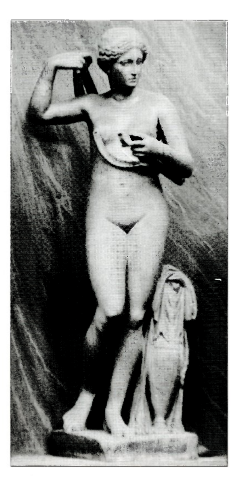
Fig. 2. Aphrodite putting on a sword. Marble statue in Florence, Accademia di Belle Arti. Heigth 1.23 m.

goddess of love and beauty, who conquers without weapons. If the sculptor got the idea of creating an 'armed Aphrodite' from the old xoana , he created exactly the same thing as the poets, changing a war goddess into the familiar love goddess and thereby reestablishing the normal gender roles of society. (One copy of the naked Aphrodite with the sword, which was found in 1974 in Nea Paphos on Cyprus, has a drawn sword in her right hand; this is obviously due to a change, perhaps made when the statue was repaired after being damaged in an earthquake.)