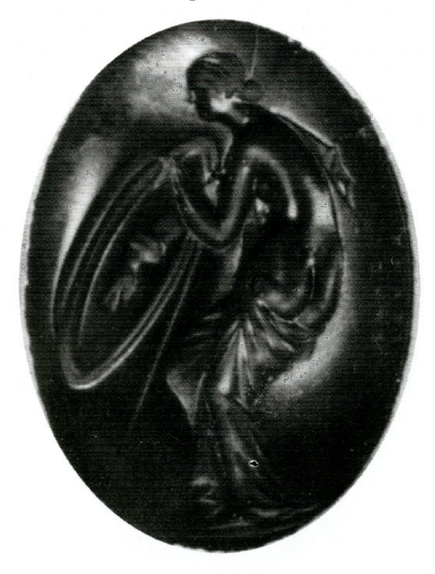
Fig. 6. Aphrodite arming herself. Impression of a garnet ringstone from Eretria. End of 3rd century B.C. Height 2.3 cm

The earliest representation of an armed Aphrodite to be considered here is the so-called Aphrodite from Epidaurus ( Fig. 7). The original can be dated ca. 380 B.C. and is likely to have been a Peloponnesian work. Unlike the representations mentioned so far, this is a more passive figure, carrying a sword in the way it is normally carried, hung on the shoulder. Dressed in a thin chiton that has slipped from the right shoulder, revealing the breast, and a mantel, the goddess is clearly characterized as a love goddess. Since the hands are missing