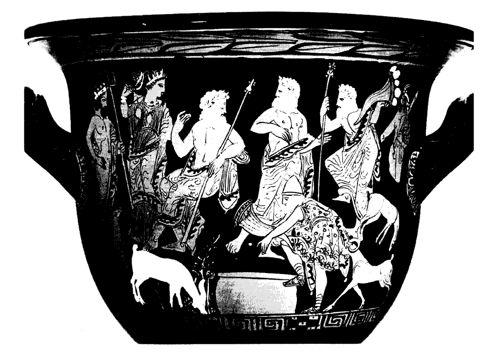
Fig. 2. Sisyphos(?) wearing chitoniskos, chlamys, sandals and pilos, and holding a horn, steps up to lean over a pithos in the ground. Goats on either side. Above Poseidon, Amphitrite, Nereus, Asopos, Hades and Pan. Bell-crater H 5982 by the Meleager painter, ca. 390 BC Martin von Wagner-Museum der Universität Würzburg

However, it must also be seen as reflecting the nature of the crimes. At this point I want to refer to the article by Christiane Sourvinou-Inwood, 'Crime and Punishment: Tityos, Tantalos and Sisyphos in Odyssey 11' (1987), being the only recent investigation of the theme.<sup>10</sup> Concentrating on the Homeric passage ( Od. 11.593-600), the article distinguishes the mytheme of Sisyphean cunning vis-à-vis Hades and thus conquering Thanatos. Sourvinou-Inwood analyses the implications of this ruse ( i.e. of omitting burial) in pre-fifth-century context, thus separating it from the later beliefs concerning a shade or a spirit returning among the living with demands of recompense.<sup>11</sup> Thus in her analysis, too, the transgression of the cosmic order is the reason for the punishment. But she focuses only on the violation of the natural law of death and ignores the other aspects of transgression which are equally present in the mythographical tradition and reflect the ensuing