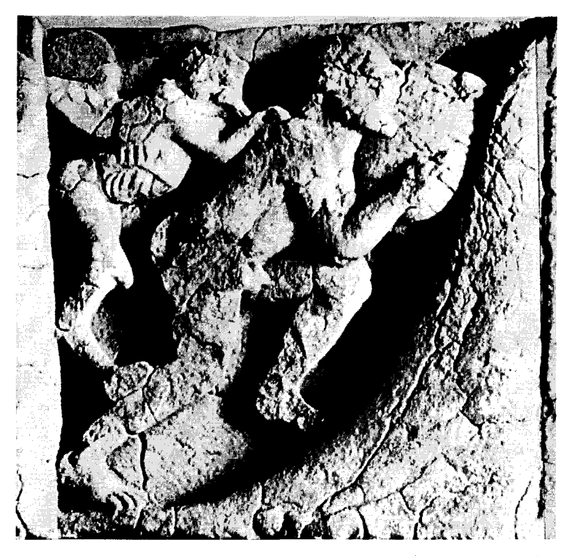
Fig. 1. Sisyphos rolling the stone, with Erinyes (?), the oldest pictorial representation of Sisyphos. Foce de Sele, metope of the Heraion (the Temple of Hera). Ca. 560-550 BC Paestum Museum

The story of the myth of Sisyphos, an Aeolian king, is preserved in its fullest form in the Renaissance mythographer Natalis Comes ( Mythologiae 1551, 1567), who collects the main variants and tries to tie them together, claiming thus to reveal the 'occult secrets' of the tale;<sup>4</sup> however, his account draws on a great number of ancient sources such as Homer, Apollodorus, Hyginus, Fulgentius, which are various and often contradictory, and, in addition, dating from vastly different periods, from ca. sixth century BC to ca. fifth century AD.