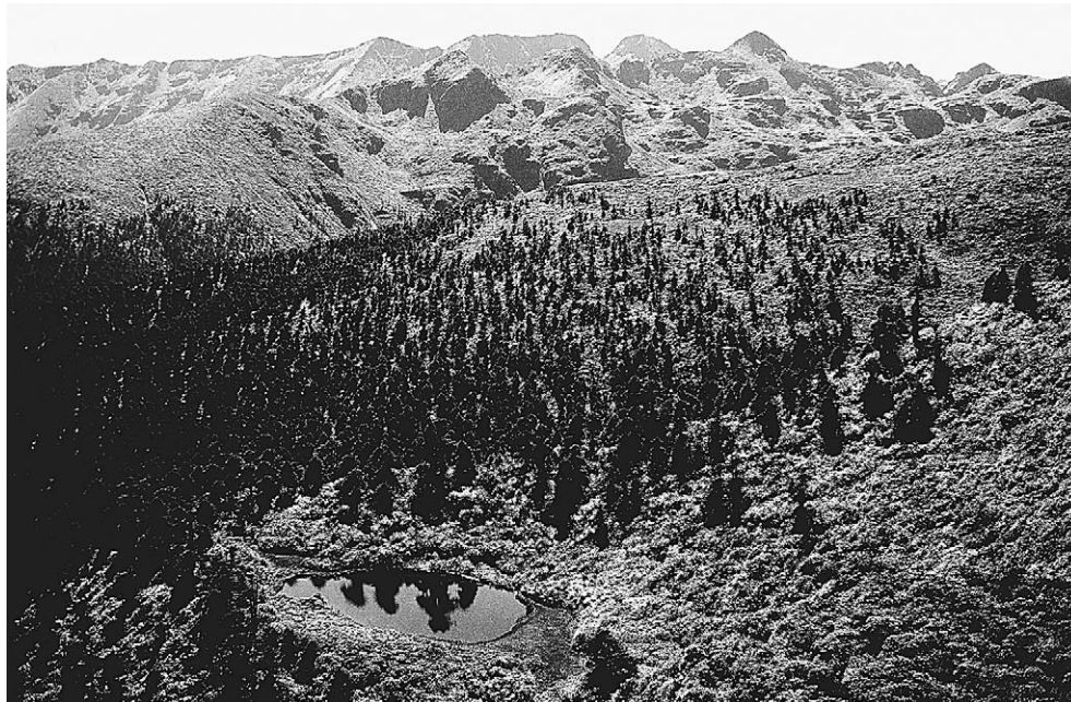
FIGURE 4 Black Mountains, Central Bhutan, 27°23' N / 0°42' E, 4250 m: probably undisturbed treeline ecotone of the southeastern Himalaya: in the treeline ecotone with a closed evergreen broadleaved rhododendron thicket, closed Abies densa forests disintegrate into isolated trees.

highest vegetation layer disintegrates over a vertical distance of only 50 to 100 m into isolated Erica shrubs or Abies densa trees, emerging from a closed carpet of 30–50-cm tall Alchemilla haumannii in Africa, or a closed thicket of 1- to 2-m tall evergreen rhododendrons in the Himalayas.