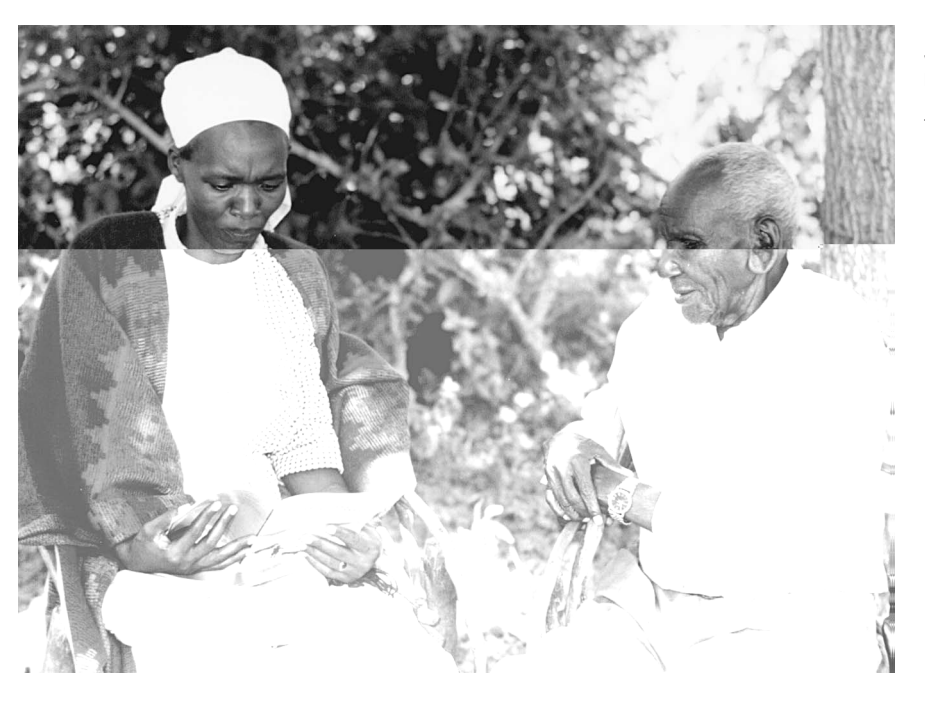
The Panos Oral Testimony Mountains Project has been an extensive and successful project thanks to the steady support of the Swiss Agency for Development and Cooperation (SDC), and the commitment and energy of our partner organizations in 10 countries: Peru, Mexico, Lesotho, Kenya, Ethiopia, China, India, Nepal, Pakistan, and Poland. In each country the Oral Testimony Programme (OTP), together with our partners, trained a team of local interviewers, most of whom had no previous interviewing experience. Our partners then coordinated the collection of testimonies (usually between 30 and 40). All partners were supported to develop information outputs based on the testimonies for local and national audiences. The OTP checked, summarized, and analyzed English translations of the testimonies sent by partners and produced a booklet series (Voices from the Mountain) and an online archive (www.mountain-

voices.org) for international audiences. A review of the booklet series will appear in the next issue of MRD.