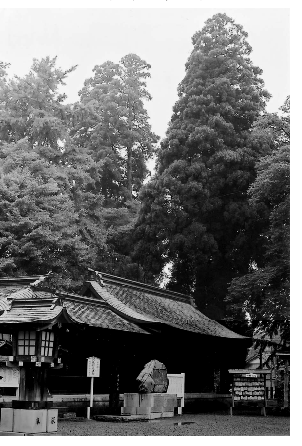
ral environment, they should be protected and conserved as a heritage for citizens.