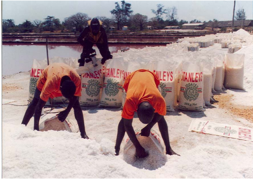
Figure 3 After iodation the process of packaging salt from the heap results in further mixing of salt with iodate and the potential to improve homogeneity.

of flat plastic or wood) to package the salt into the fifty-kg bags (Figure 3).