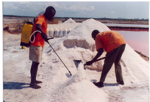
Figure 2 Iodation of salt using a knapsack sprayer and manual mixing of a 2-ton salt heap.

The iodine levels achieved using the diesel/petrol-powered cement mixer recommended as an iodate mixing machine [24] were compared with those achieved by the manual mixing method using the mat/polyethylene sheet. For all heaps studied, the workers used a cropper (a piece