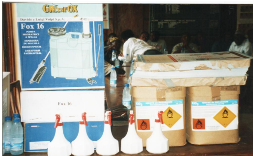
Figure 1 Essential equipment: knapsack sprayer, hand sprayers (white containers with red nozzle), \text{KIO}_3 and instructional literature for small scale salt iodation.

The potassium iodate in use ( \text{KIO}_3 , molar weight = 214.9 g/mol, estimated cost $18/kg) originated from the INQUIM Company in Chile was purchased through UNICEF. It conformed to U.S. Food Chemical Codex specifications [7].