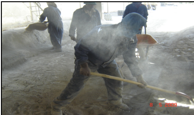
Figure 2 Cleaners in the packing department