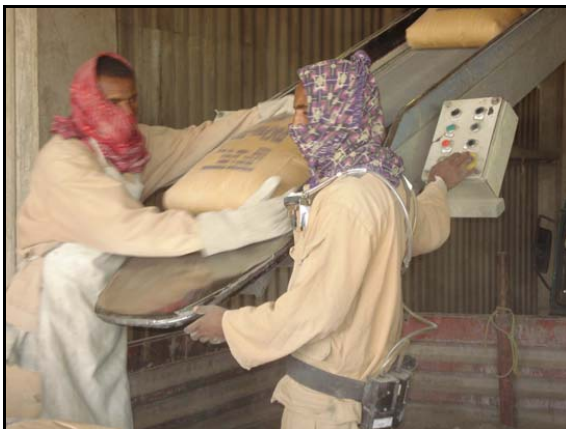
Figure 9 Cement loaders in the packing department