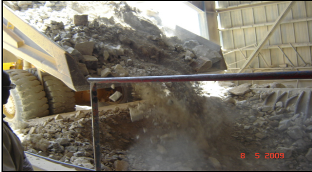
Figure 3 Dumping of raw material into the crusher machine

quarry site to the dumper trucks while dumper operators dump the raw material into the crusher machine (Figure 3).