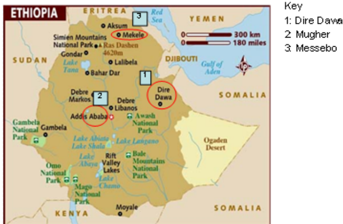
Figure 10 Map of study areas and location of cement factories

This study was conducted in three cement factories in Ethiopia (Figure 10). Dire Dawa cement factory (1) is located 500 km east of the capital, Addis Ababa. The production capacity in 2005 was about 34,000 tons of cement per year and run by 320 workers. The factory commenced production in 1945. Muger Cement Enterprise (MCE) (2) is located west of the capital. In 2009 it had about 1336 workers. It has operated at a capacity of 600,000 tons of cement per year since 1984. Messebo (3) is situated north of the capital. The annual production capacity is 630,000 tons of cement and the factory had 740 employees in 2009. It started the production in 2001.