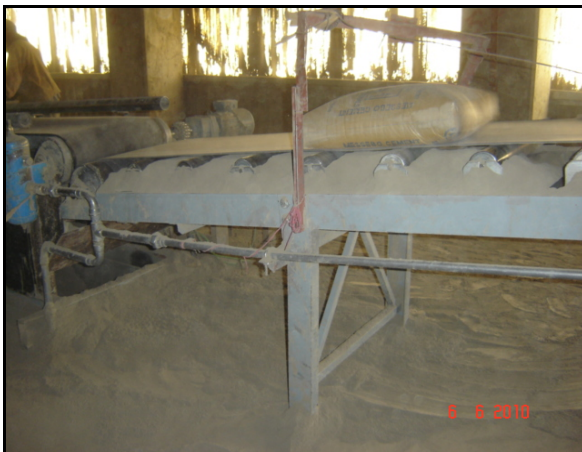
Figure 7 Filled cement bags on the conveyor belt