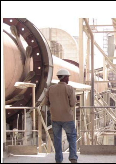
Figure 6 Kiln operator while on periodic check of the process