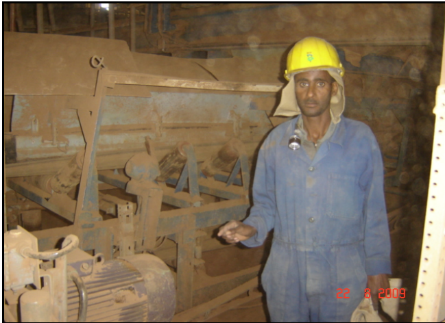
Figure 5 A raw mill attendant in the raw material proportioning section