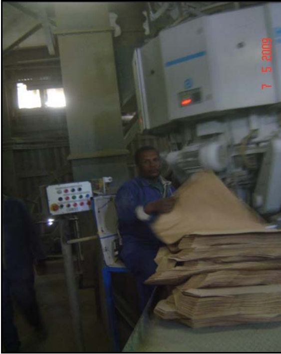
Figure 8 Cement packer in the packing department