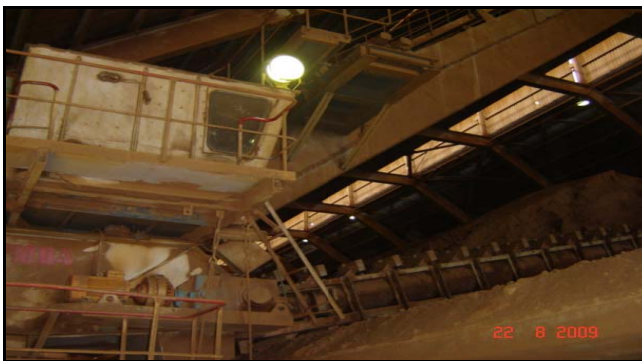
Figure 4 A crane operator on duty inside the cabin rearranging stored materials