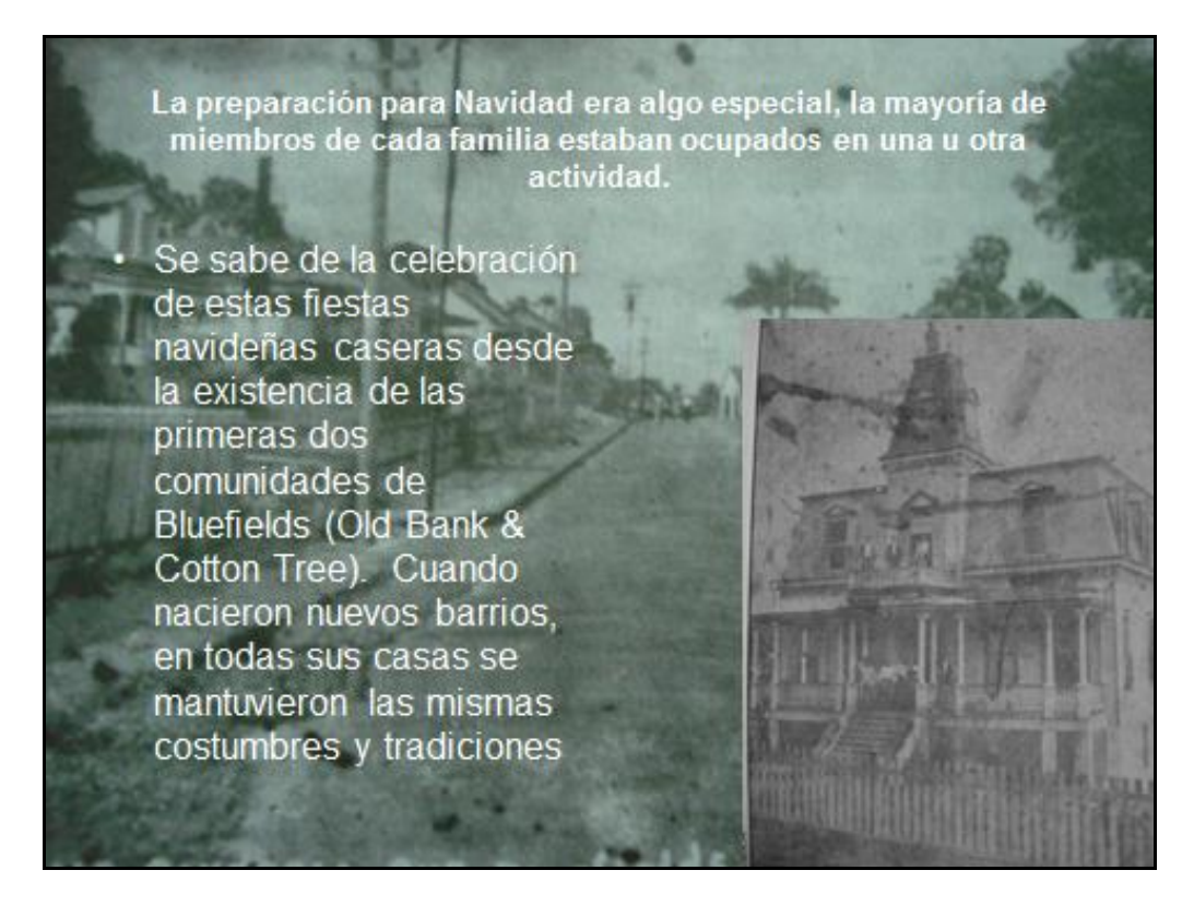
Figure 11: Side from power-point presentation. Prepared by OCCA, and presented at Liga de Saber.