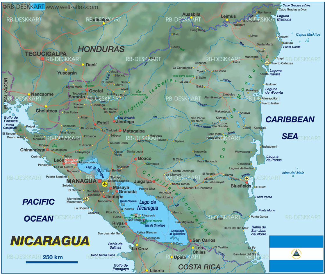
Figure 1: Map of Nicaragua. Derived from http://www.welt-atlas.de/datenbank/karten/karte-8-641.gif