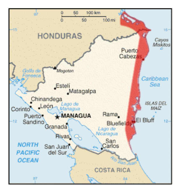
Figure 2: Map of Nicaragua, on which the Atlantic Coast is marked out with red.