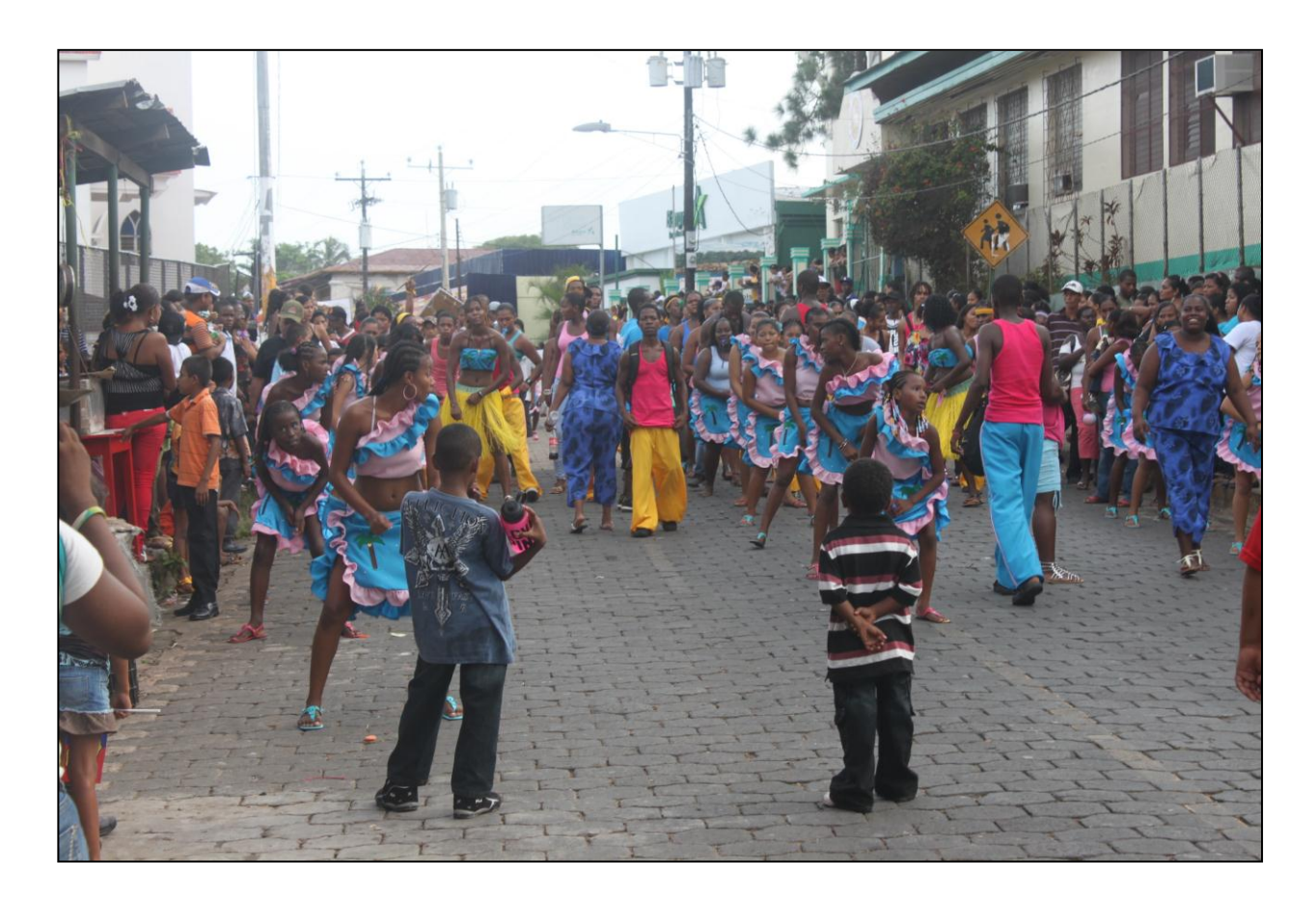
Figure 9: Día de los Comparsas

For several days, you can hear people around in different parts of the city discuss the outcome and the accomplishment of this year's costumes, and the performing of the dance. The route is a pretty long run, and the participants dance and dance for hours in the burning hot sun. Sweat, laughter, music, booty shaking, clapping, and the sounds from the drums continue. When the whole parade is finished, people meet up in the park where it is time to elect the winner. The different teams await their turn to enter the stage for their dance performance. The day ends with an election of the neighbourhood with the best dancers. The 'traditional' Creole neighbourhoods such as Beholden, Cotton Tree (called Punta Fría in Spanish), Old Bank and Pointeen are usually good candidates. Afterwards, the arrangements continue with different prominent characters in the city, as the mayor, and some local government officials keep on entertaining. In 2011, the toastmasters were Spanish-speaking people from Managua. Periodically, the speeches are interrupted by musical acts and competitions, where t-shirts are handed out to the winners. The area is packed with people,