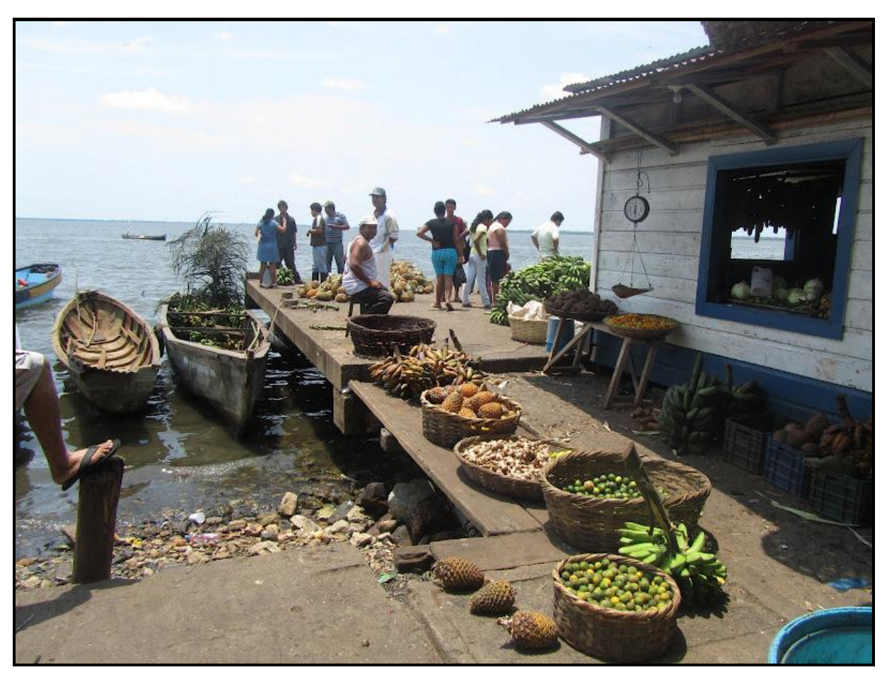
Figure 5: The harbour in Bluefields

descent (Gordon, 1998:60). In RAAS in 2006 Creoles only formed 5, 5 percent of the population, while 80 percent were Mestizos.<sup>23</sup> I will soon come back to these changes, but first turn to the city of Bluefields.