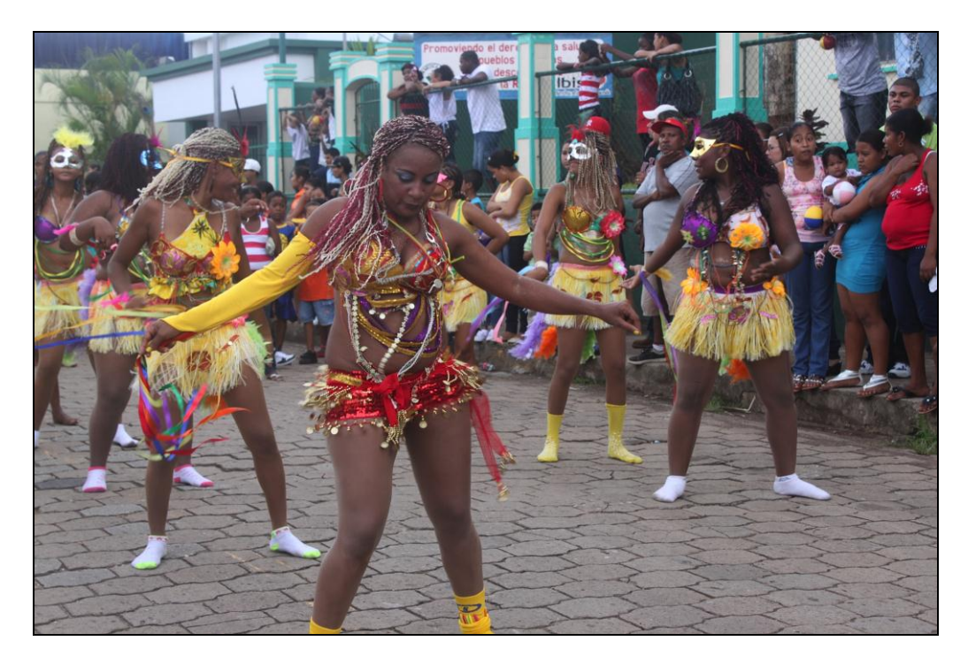
Figure 8: Día de los Comparsas

In this chapter I will empirically describe the prominent festival in Bluefields May Pole, which I will later use as a prism to study the relationship between state and periphery in Nicaragua. The chapter will start with a description of the month-long festival and its most important events, continue with a piece about the organization of the festival, and end with a brief introduction to the historical background and the changes May Pole has experienced.