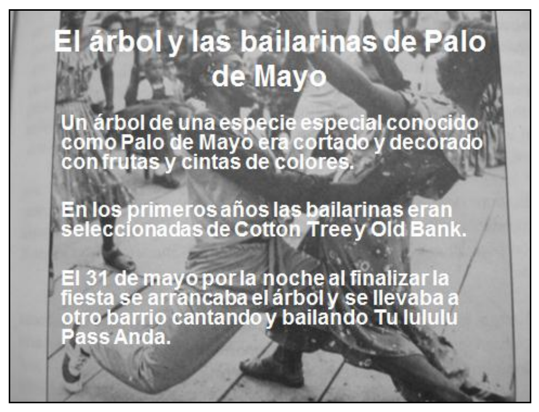
Figure 10: Slide from power-point presentation. Prepared by OCCA and presented at Liga de Saber.