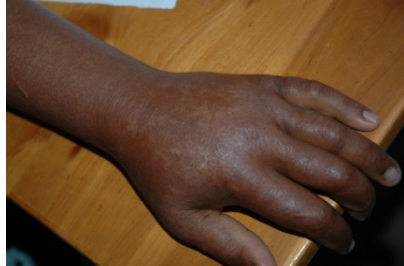
Rash/oedema over hands/knuckles