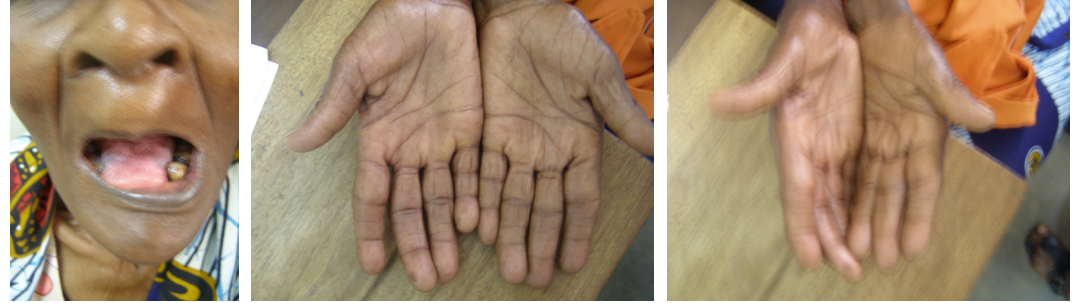
Figure 14.6 Bulbar/pseudobulbar palsy