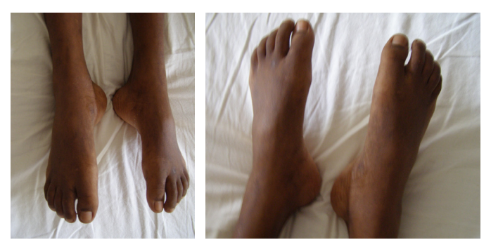
Figure 14.7 Progressive muscular atrophy. Foot drop (bilateral) in MND

PMA accounts for about 5% of cases. PMA presents as progressive lower motor neurone weakness in the limbs (Fig. 14.7). The neurological findings are weakness, wasting, fasciculation and absent reflexes. Bulbar involvement may follow. Survival times are 4-5 years.