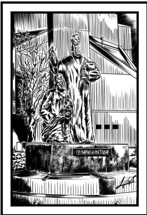
Statue depicting St. Cyril and Methody, at the university with their name.

Simon the Great (893-927) ruled a Bulgarian state including Macedonia, going all the way to the Adriatic ocean. The kingdom was split in two; Tsar Samuil got the west, with Ohrid as capital. Macedonian nationalists like calling this rule the first Macedonian state. But then the Byzantine time came. 37